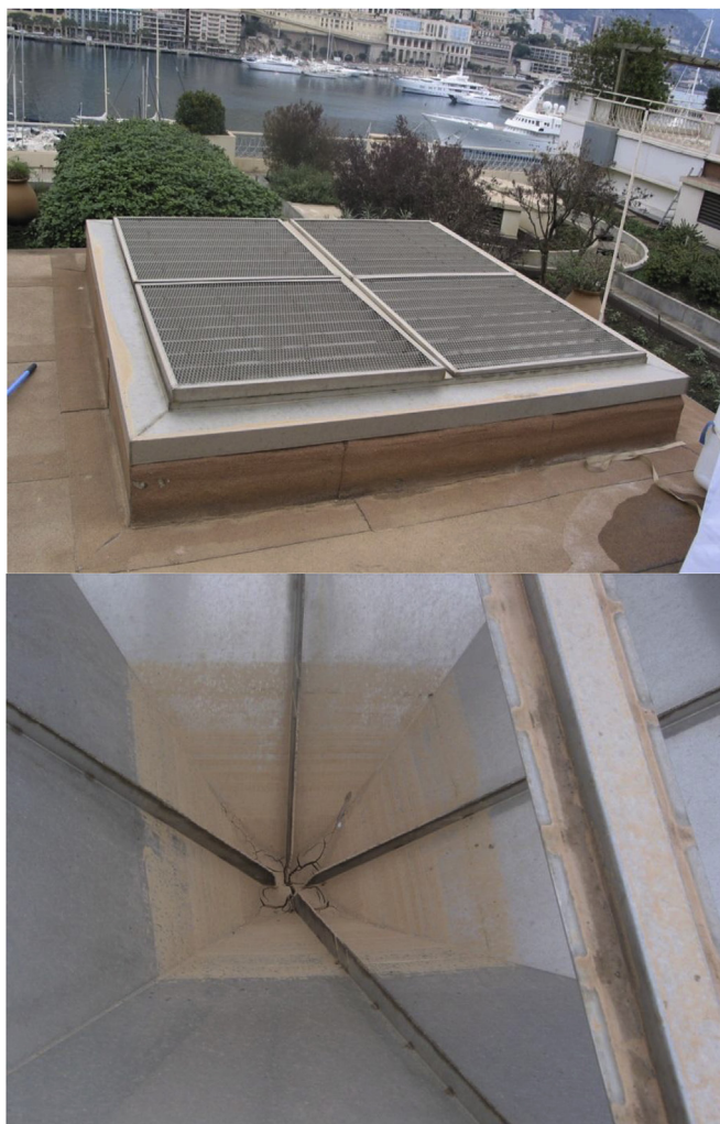
Fig. 2. Stainless steel collector on the roof of IAEA-EL premises in Monaco for collection of dry and wet deposits (Note in the lower part shown the important residue of dust deposition SD1 collected on the 20 February 2004).