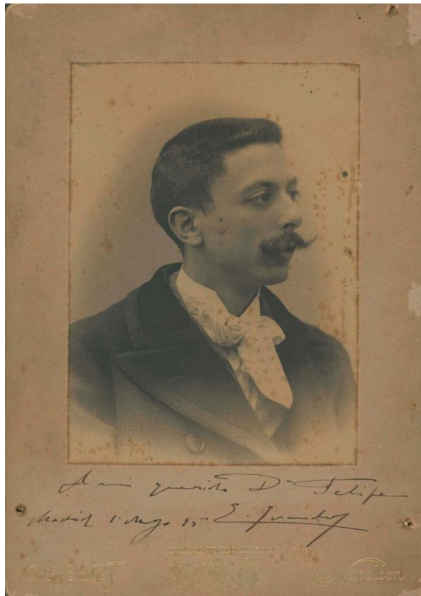
Figure 2. Photograph of Enrique Granados, with a dedication to Felipe Pedrell, 1895.