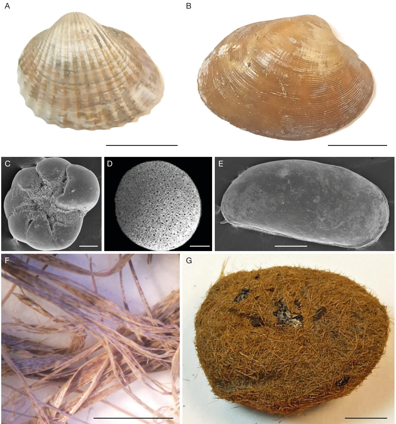
FIG. 3. — Main species of core PT: A, B , bivalves: A , Cerastoderma glaucum (Bruguière, 1789); B , Polititapes rhomboides (Pennant, 1777); C, D , foraminifera: C , Ammonia tepida (Cushman, 1926), umbilical view; D , Orbulina universa d'Orbigny, 1839; E , Ostracoda: Cyprideis torosa (Jones, 1850), right valve; F, G , plant remains: F , fibers of Posidonia oceanica (L.) Delile; G , "Neptune ball" of Posidonia oceanica . Scale bars: A, B, G, 1 cm; C, D, 100 µm; E, 200 µm; F, 3 mm.

is even higher in F4, with a high number of individuals of Ammonia tepida (>80% of the specimens; >50 individuals/gram) and frequent Haynesina depressula (Walker & Jacob, 1798) and Elphidium crispum . In this facies, the planktonic forms are represented by Globigerina bulloides d'Orbigny, 1826, while Loxiconcha elliptica (30–40 individuals/gram) is the most representative ostracod.