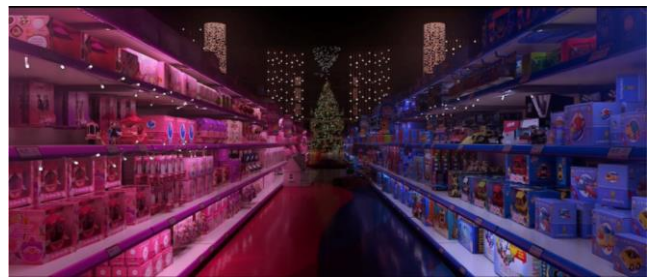
1f. Use of colours