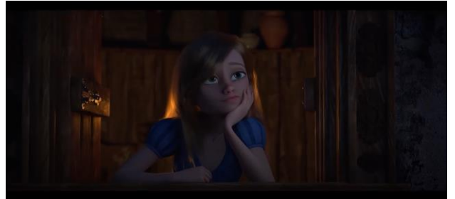
2b. Medium shot