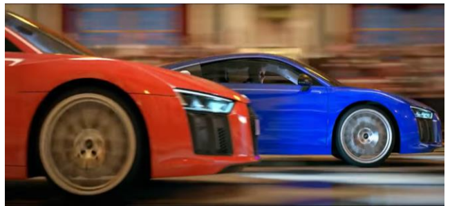
2f. Use of colours