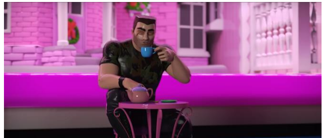
1d. Subjective shot