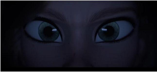
2c. Extreme close-up