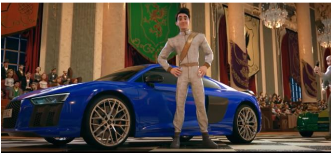
2e. Low angle