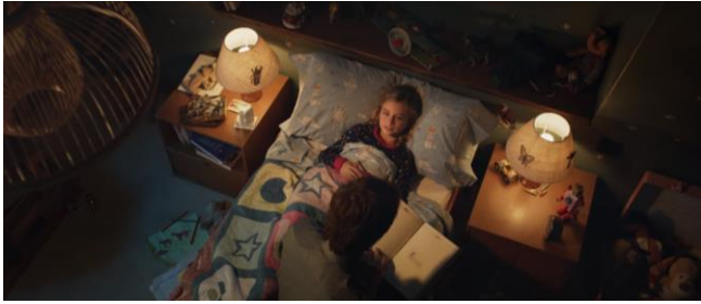
2a. Centered composition