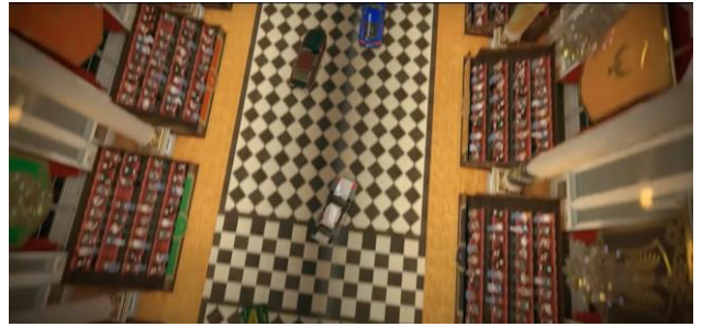
2d. Zenith shot