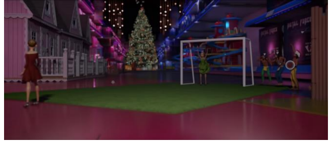
1b. Long shot