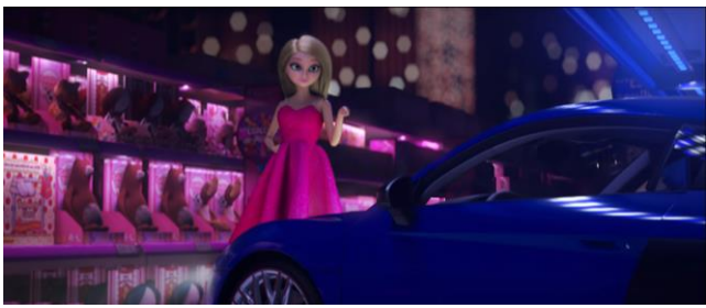
1e. Low angle