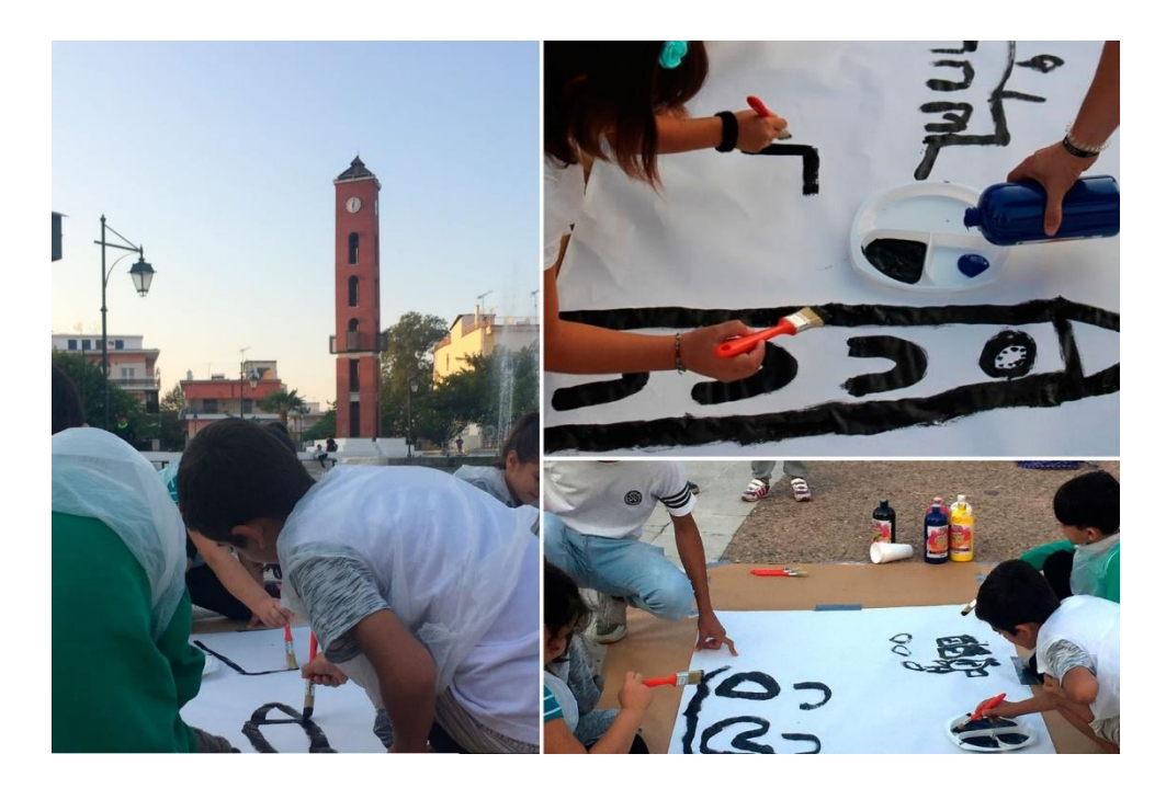
Figure 5. Take the square. Collage and photographs by Communiars.

4) Inhabit the gaze (Figure 6). In the facilities of OCC, we proposed a dynamic of virtual reality from the combination of screen projection and software, which facilitated a live chroma key . The children submerged in the paintings made in the street and in the square, becoming a game of reimagination of the environment and habitat.