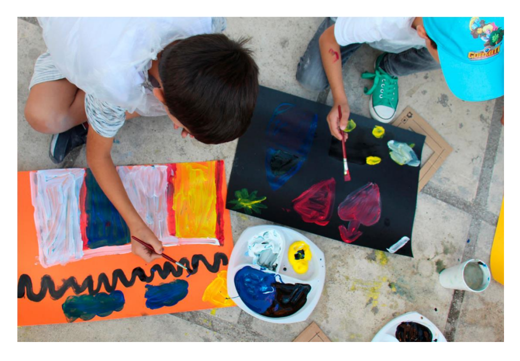
Figure 4. Visualising the street.

3) Take the square (Figure 5). In the third step, we carried out a collective and pictorial intervention again using large-format paper (100 cm × 400 cm). In a single large group, the children drew the most representative space of the town: we approached the main urban space of the municipality, with the aim of generating bonds among equals and with the Greek community through artistic expression.