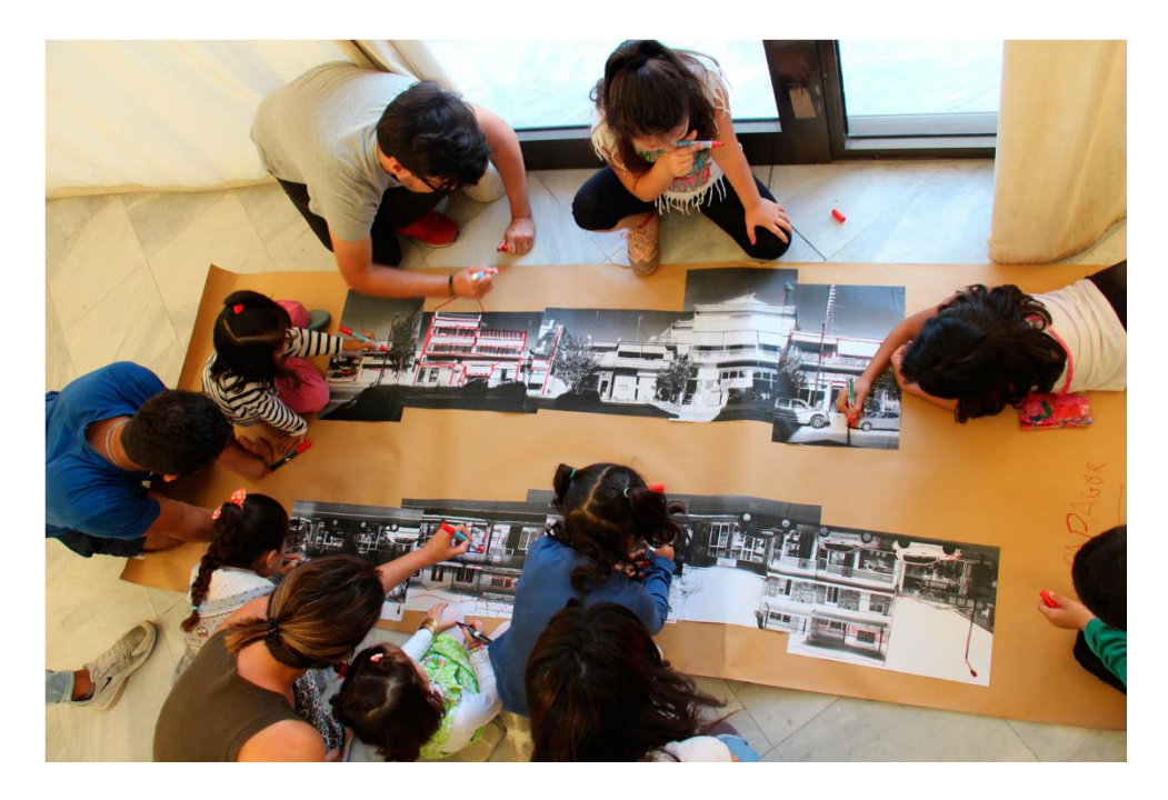
Figure 3. Outlining our territory.

delimited the contours of the buildings represented in black and white pictures. With this action, the children submerged in the graphic intervention from a visual guide, which, apart from facilitating the development of fine motor skills, allowed them to reflect on the awareness of their immediate surroundings from a graphic perspective.