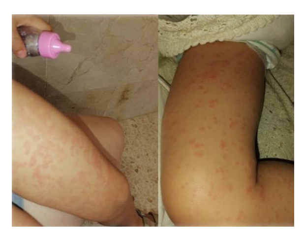
Figure 3. Girl aged 6-year-old with COVID-19 and with lower limb erythema (maculopapular rash with pruritus).

The second most frequent rash in patients with COVID-19 is urticaria, which is more frequent in women (66%) of an average age (47.6 years). Urticaria is the presence of raised, reddish wheals that are often pruritic and appear in different circumstances, and may even be idiopathic [13]. The highest number of cases was reported in Spain, occurring mainly during the active phase of the infection [11]. Erythema pernio is the oedematisation of the smaller blood vessels that innervate the skin, resulting from vasoconstriction and hypoxaemia caused by prolonged exposure to cold and then to sudden heat. Footcare professionals should establish a differential diagnosis with Raynaud's syndrome, acrocyanosis, vasculitis, lupus erythematosus, livedo reticularis , and significant ascorbic acid deficiencies [14]. There is no consensus among authors regarding the manifestation of livedo reticularis , which is a rash characterised by a bluish-red mottling of the skin in the form of a web. There is an idiopathic form that particularly affects the legs, thighs, and buttocks, which is accentuated by cold and is more common among women under 40 years of age [14].