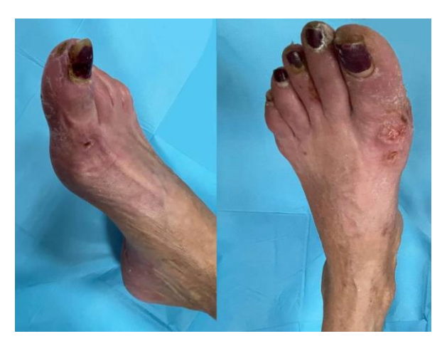
Figure 2. Woman aged 54-year-old with acral lesions caused by COVID-19 on both feet (blisters on the toes similar to perniosis).

Patchy acrocyanotic lesions have been sometimes described with blisters on the fingers and toes, similarly to perniosis and occurring in children and adolescents without other symptoms [10]. These apparently less-severe dermatological signs may be directly associated with the disease and are, therefore, of the utmost importance for healthcare professionals to detect, given that the incidence of dermatological signs of COVID-19 in December 2020 was between 0.2% and 29%, even in undiagnosed patients [8]; see Figure 2.