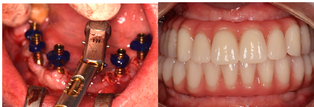
Figure 3. Placement of prosthetic abutments and implant-supported fixed prostheses.