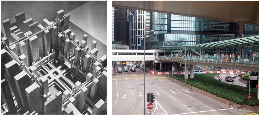
Figure 7: (A) Second New York Regional Plan, 1969 [13]; (B) Hong Kong Skywalks.

(exterior pedestrian bridges over streets), interiorized walkways, elevated parks, and exterior escalators that scale the steep hillsides. In the book Cities without ground: a Hong Kong guidebook , authors write: ‘Urbanism in Hong Kong is a result of a combination of top-down planning and bottom-up solutions, a unique collaboration between pragmatic thinking and comprehensive masterplanning, played out in three-dimensional space. Footbridge networks throughout the city that grew piecemeal, built by different parties at different times to serve different immediate needs, eventually formed an extensive network and became a prevailing development model for the city’s large-scale urban projects’ [12].