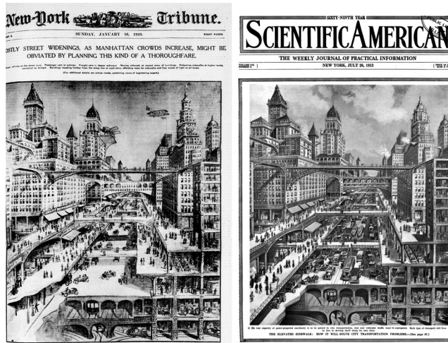
Figure 3: (A) Newspaper New York Tribune 16th January 1910 [4]; (B) Scientific American magazine 26th July 1913 [5].

by engineer Henry Harrison Suplee, apparently the same author from the New York Tribune article. The main difference between these almost twin images was centred on the accumulation of traffic on the ground floor. Once the city had been organized on different levels, with pedestrians roaming freely on the upper sidewalks, the biggest advance focused on transportation. While the 1910 cover showed cars winding freely, the 1913 cover presented a tram in the centre that separated the large avenue in two.