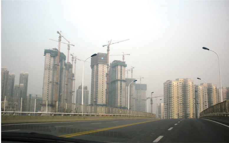
Figure 1: Tianjin, China.