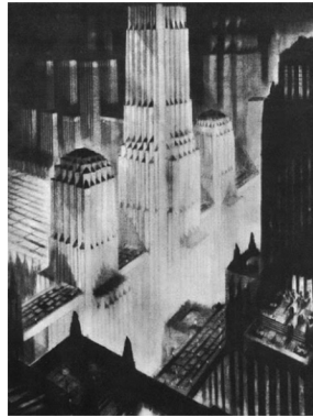
Figure 4: Hugh Ferriss. The Metropolis of Tomorrow , 1929 [6].