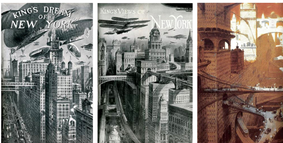
Figure 2: (A) 'King's Dream of New York' by H. M. Pettit in 1908 [1]; (B) 'King's Views of New York' by R. Rummell in 1911 [2]; (C) Drawing by W. R. Leigh, 1908 [3].

The now-defunct New York Tribune newspaper, in its print run on Sunday, January 16, 1910, published a full-page drawing that returned to the three-dimensional city in several layers and levels. Inside the newspaper, a column titled Sees future New York: Sidewalks in layers and other wonders in Mr. Suplee's Ken (Fig. 3) could be read. Strangely, three years later, the same lightly tweaked drawing appeared in the weekly Scientific American in late July, illustrating The Elevated Sidewalk: How it will solve City Transportation Problems (Fig. 3)