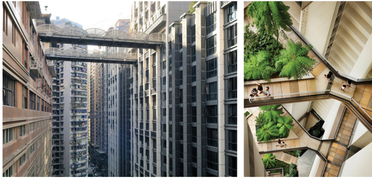
Figure 9: (A) Skybridges in Chongqing, China, 2019 [16]; (B) WOHA, Skyville Dawson , Singapore, 2015 [17].

landscape of a Chinese megacity where some pedestrian skyways, subway lines and railways interceded in tallness among towers that make up the city. It was Chongqing, the city that exercises control over the Three Gorges area of the Yangtze River, one of the densest and most developed urban concentrations in the centre of China. When contemplating the aerial photos of this city, one perceives a certain overflow of urbanism; a high concentration of almost identical towers that obscure the sky and hide the horizon. What is unusual, which distinguishes some neighbourhoods in this city from many others in the same country, is the existence of an elevated network of streets, promenades, rails and even cable cars. Unlike the model of towers planted on a plane in which the only point of contact with the city occurs in the lobby on the ground floor, various aerial streets in several districts of Chongqing cross residential, commercial, mega blocks offices, regardless of their nature or use, to shorten roads and detach themselves from the ground-level.