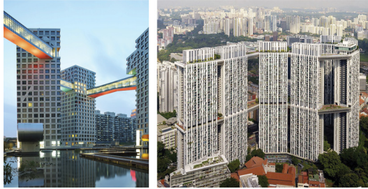
Figure 8: (A) Steven Holl, The Linked Hybrid , 2009 [14]; (B) ARC+RSP, The Pinnacle Duxton , Singapore, 2009 [15].

the gestation of the project, the city model that Steven Holl tried to make us understand was concentrated. It consisted of three small skylines of cities: the first showed a horizontal city of small buildings until 1980, the second exhibited a city of isolated and repeated monofunctional towers from 1980 and finally, the third (the Holl's proposal) was drawn as a city of hybrid skyscrapers connected by skyways as a multilevel city. And this is the most interesting idea for this research: the elevated street that links the eight towers. The elevated street, with a variable width between five and fifteen meters, began at level twelve of the hotel tower at one end, and reached level eighteen on its way to the tower that encloses the site, leaving the ring unfinished. Holl placed program in these glass bridges or skybridges, including a gym, an art gallery, cafeterias, and even a swimming pool, with the added complexities that this implied structurally. The complex was intended to be a fragment of a self-sufficient city, hybridizing all kinds of uses between the volumes of the ground floors and the high street as a pedestrian system. Linked Hybrid thus housed a population of 2,500 inhabitants, aspiring to become an avant-garde prototype of the urban lifestyles of the 21st century.