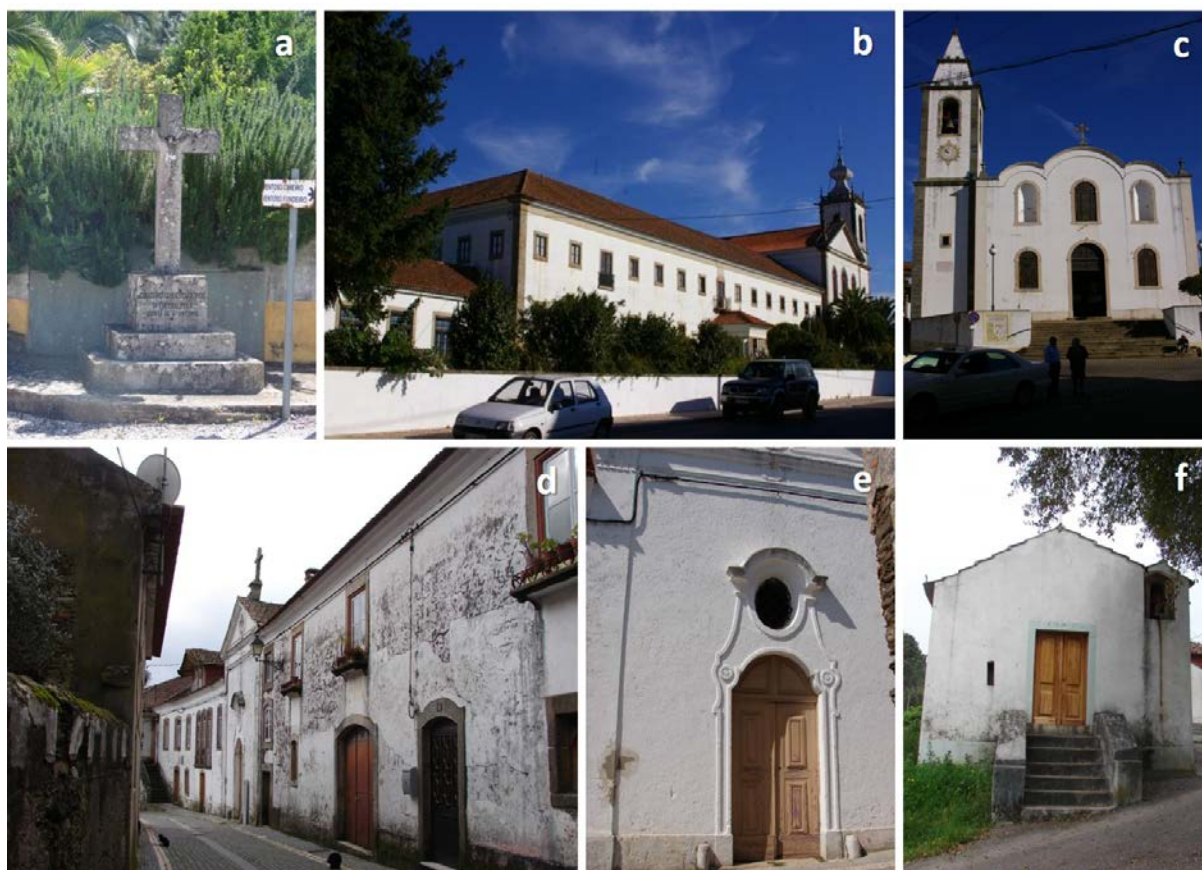
Figure 1. Examples of the type of religious heritage in the parish of Cernache do Bonjardim: a) Escudeiros' field cross; b) Built sets: Cernache's Seminary; b) Church of S. Sebastião de Cernache do Bonjardim; d) e) Manor house of Rua Torta and chapel of N. Sr a da Conceição in Cernache do Bonjardim; f) Sambado's chapel (authors)

To make it easier to analyse and characterize, the elements collected were grouped into types, according to their initial use, with four groups being obtained: field crosses; built sets; manor houses; churches and chapels, which are presented. Figure 1 shows an example of each of the types considered. More details can be found in Gonçalves (2016) [2].