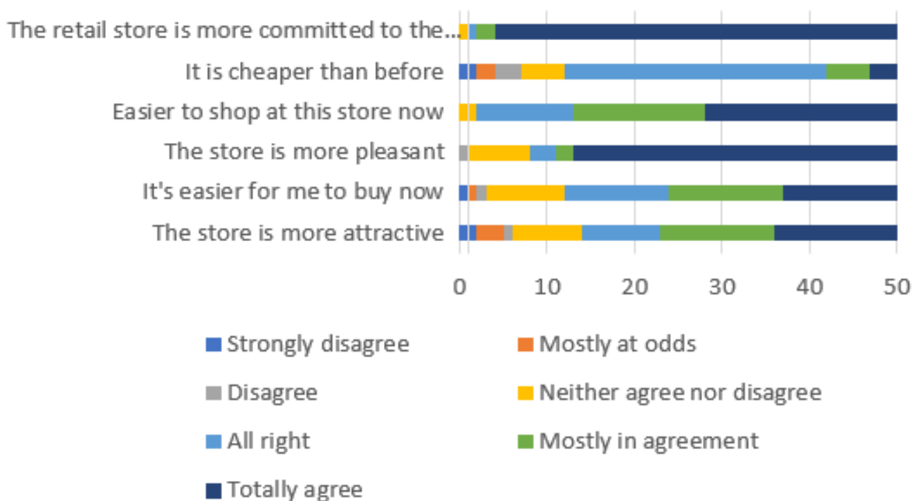
Figure 1. Perception of the store after the experimentation.

For customer satisfaction, the preferences for sustainable men's fashion choices were considered, which could be observed using the Likert scale. The following Figure 1 shows the results: