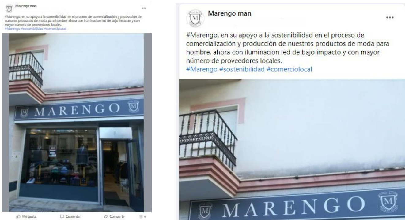
Figure A2. Screenshots of Marengo’s Facebook Fanpage. (Due to the store is in Spain, its comments were captured in Spanish. See, therefore, the translation: “#Marengo, in its support of sustainability in the marketing and production process of our men’s fashion products, now with low impact led lighting and more local suppliers. #Marengo #Sustainability #LocalShopping”. (Own translation))