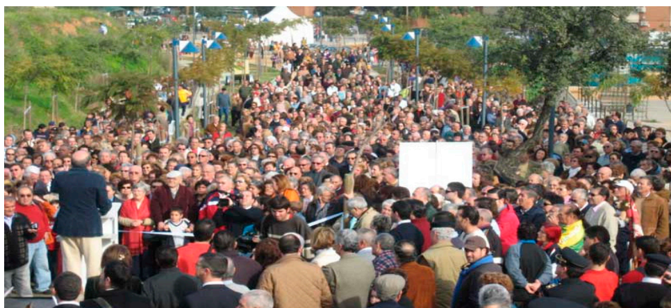
Figure 3. Official opening of Moret Park.