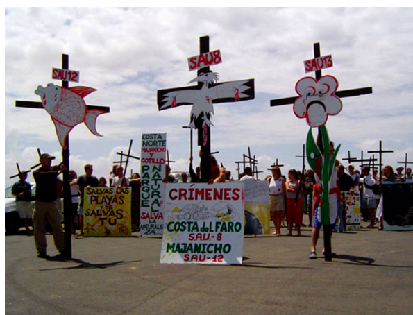
Figure 6. Image of citizen protests due to the development of Cotillo and Majanicho urban plans, in La Oliva Town, Fuerteventura.

This case therefore provides the opportunity to turn a participatory process, as part of an ex-post environmental impact assessment (encouraged partly by citizens and partly by the public administrations involved), into a programme: “Citizen participation programme in the framework of the Environmental Impact Assessment for the Majanicho housing development project—SAU 12, La Oliva (Fuerteventura)”. In the short term, this could contribute to the design and adoption of the appropriate compensatory measures, and in the medium to long term, it could result in the