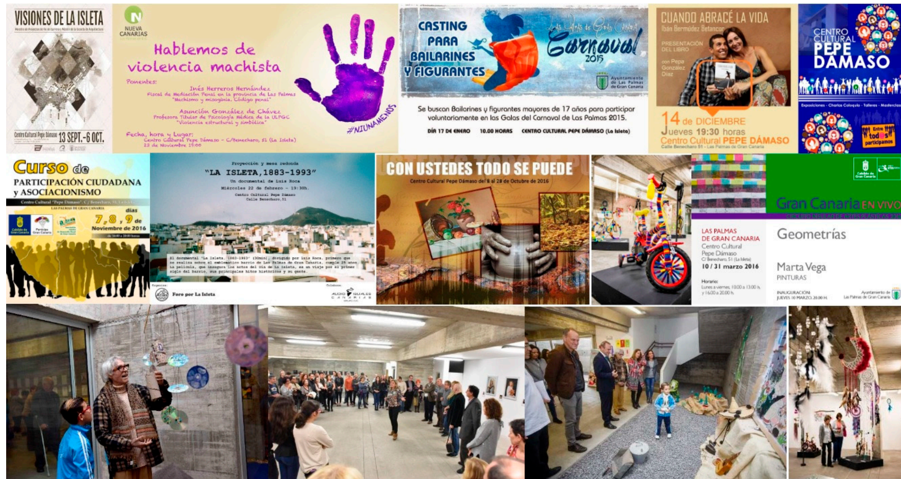
Figure 5. Example of the various social and cultural activities currently being carried out in the Pepe Dámaso Cultural Centre.