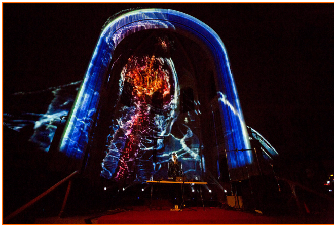
Figure 4: William Basinski performing On Time Out of Time at St George's Episcopal Church, New York, with site-mapped lighting designed by video engineers Eric Epstein and Martin Tzonev

Having been performed live on several occasions after its release in 2019, On Time Out of Time has grown and expanded in terms of installation. When it was initially commissioned by science artists Domnitch and Gelfand, there was a visual counterpart to the original aural experience. As a result, On Time Out of Time , usually performed in churches and museum spaces, has become a multimedia artwork in which light and projections play a leading role in enriching the sonic narrative (Figure 4).