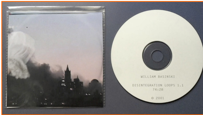
Figure 3: William Basinski, dlp. 1.1 , 2001. First presentation format of the work

The four volumes that sustain The Disintegration Loops were individually released in 2002 and 2003 to the immediate praise of avant-garde art and culture circles. The presentation and distribution format of the work – a formally succinct CD packaged in a plastic sleeve – (Figure 3, however, contributed to its visual component being disregarded). Only in 2012 was the artwork relaunched as a box set containing a DVD with the video record of Manhattan's damaged skyline made by Basinski as the day drew to a close. In this regard, other exhibitions of the artwork, for example its permanent installation at the 9/11 Memorial and Museum, allow for a better understanding of it, as it is shown in tandem with the video and other memorabilia. According to Lindsay Balfour, " The Disintegration Loops is unlike any other installation in the Museum, not only for its experimental and avant-garde aesthetic but in the way that it is framed within a historical narrative that is propelled primarily by commemorative anecdotes, time stamps, tangible artifacts, and eyewitness and news accounts" (2018, n.p.). Consequently, in the context of the museum, the work acts both as digital sound and a visual landscape that can be regarded as a sound installation, requiem music, and documental piece.