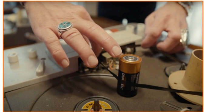
Figure 1. Basinski manipulating old tapes from his archive to create sound loops

of destroying the original analogue source, which linked the work to the conventions and formulas of deconstructivism. Basinski's decision to “stay out of the way” can be read as a pivotal creative strategy, since it allowed him to abandon the role of composer and adopt the role of supervisor, interfering as little as possible.