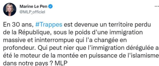
Figure 2. Tweet of Le Pen on immigration/security.

Opposing to the rest of leaders, Le Pen (Rassemblement National) applied hashtags in almost all her tweets. This tool was used to identify enemies (#Macron) or problems (#migrants), as well as to mention cities or neighborhoods (#Reims, #Bron, #Essone, #Trappes). These places were usually referred to because of security problems, with the tweets signed by Le Pen herself (Figure 2). As stated in the research on issues and strategies, immigration and security are the topics that define her communicative style. In addition, Le Pen employed the hashtag #PJLPrincipesRépublicains to claim her defense of the values of the French republic, identifying those values as a nationalism that confronts immigration.