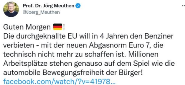
Figure 3. Tweet of Meuthen on the economy.