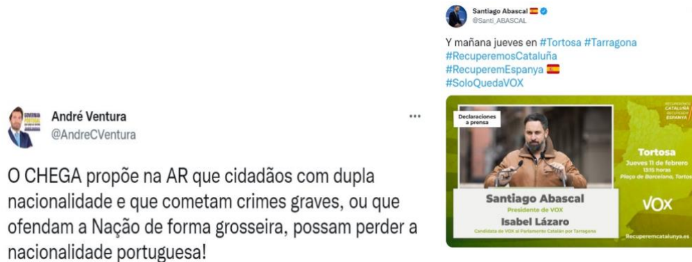
Figure 1: Examples of issue frame (immigration/security) and game frame (political strategy frame).

Sources: @AndreCVentura and @Santi_ABASCAL.