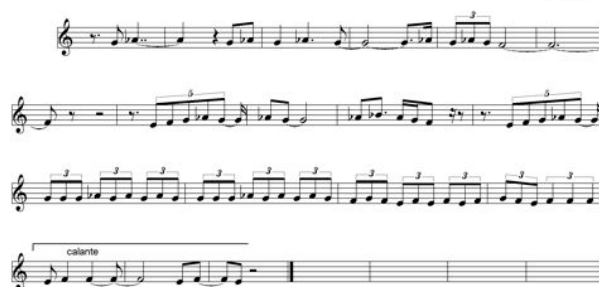
Figure 1: Manual transcription of a cante (debla).

Debla: "En el barrio de Triana" Chano Lobato