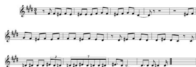
Figure 2: Transcription of another version of the previous cante .