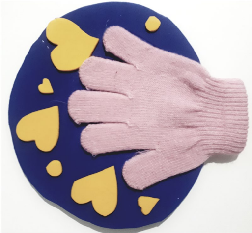
Figure 1. Partial unaffected hand containment.

changing to act as the operating hand in the last 4 weeks. For the 2 weeks of BIT in the mCIMT-B program, the affected hand was given the assisting role for the first week, and then the operating role for the second week. Some examples of activities for both therapies are shown in Table 1 and Figure 2.