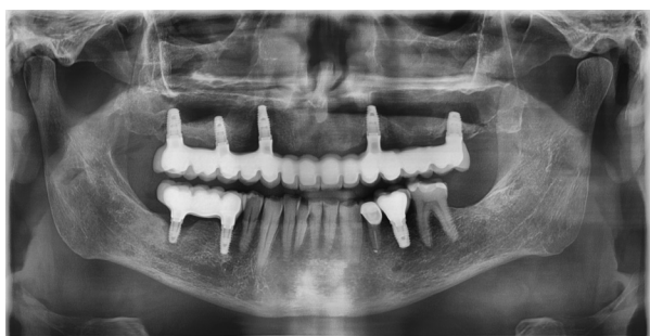
Fig. 3: Orthopantomography carried out after one year of follow-up in which the patient showed no symptoms of sinus infection.

DID into the maxillary sinus can act as foreign body causing serious complications, so that, it should be removed as soon as possible, even in asymptomatic patients, to prevent the spread of infection to paranasal sinuses or other vital sites (1,7). The timing of surgical intervention should be as close as possible to the foreign body insertion to minimise mucosal inflammation and to prevent discrepancies in the location of the implant (6). The explanations of how implants migrate inside the maxillary sinus have not been clearly defined. It could be explained if it is assumed that the implant breaks through the natural maxillary sinus ostium with the aid of the mucociliary action so that the displaced implant can be accidentally swallowed or aspirated, which may be life-threatening (8). These complications are rare; however, it can be a cause of odontogenic sinusitis (10) because it can cause impairment of the mucociliary clearance mechanism (2) or tissue reaction (5). The most significant sequela due to foreign bodies in the maxillary sinus is chronic sinusitis with or without nasal polyps, which may cause serious conditions such as pansinusitis, panophthalmitis, and orbital cellulitis (1).