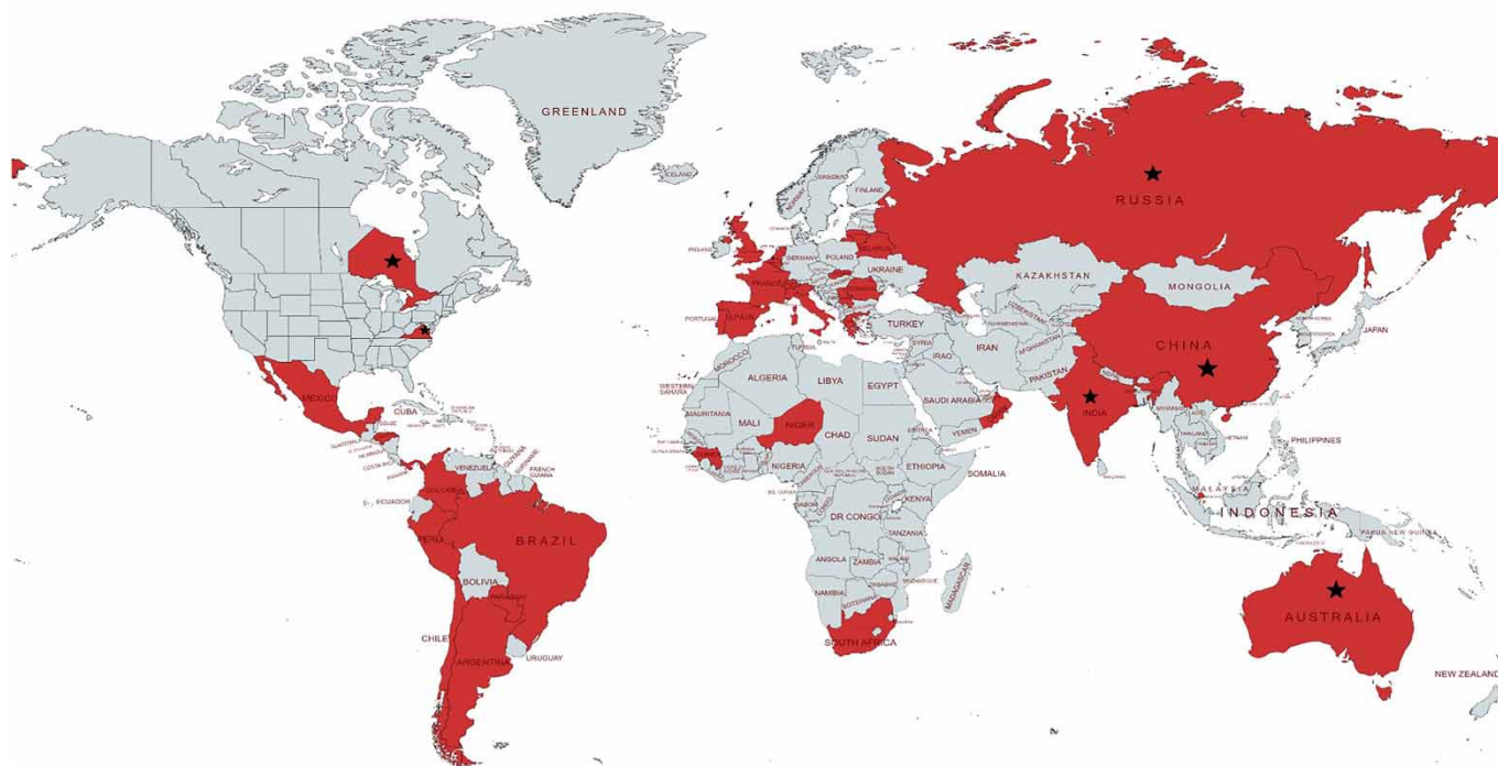
FIGURE 1 Global distribution of the countries/states/regions participating in the study. The following states/territories are covered in the study (★): Australia (New South Wales); Canada (Ontario state); China (Wenzhou and Luzhou); India (New Delhi, Mumbai and Maharashtra states); the Russian Federation (Arkhangelsk, Moscow and Volgograd Oblasts); Switzerland (Vaud county); USA (Virginia state). 21 countries (Argentina, Belarus, Belgium, Brazil, Chile, China, France, Republic of Guinea, India, Italy, Mexico, Niger, Panama, Peru, Portugal, Romania, Russia, Singapore, Spain, Switzerland and UK) reported at least one tuberculosis/coronavirus disease 2019 case in 2020. Other countries (Australia, Canada, Colombia, Greece, Honduras, Lithuania, the Netherlands, Oman, Paraguay, Serbia, Slovakia, South Africa and USA) started reporting from 2021.

The study is based on a prospective, anonymised, multicountry register-based cohort (annex 1). We worked with WHO and the GTN to identify respondents and send invitations to 175 centres in 37 countries [22]. The centres and countries providing data are listed in annex 2 and figure 1; we enrolled all patients (including children and adolescents) notified to these centres between March 2020 (first case reported on 12 March 2020) and June 2021. The questionnaire and process was piloted and has been