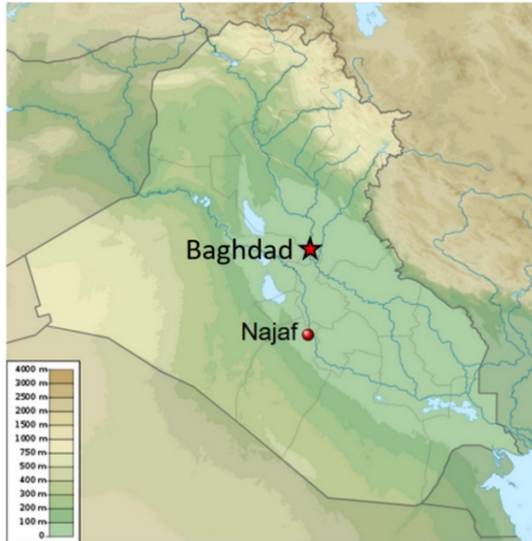
FIGURE 1. Location of Najaf. Elevation map (Urutseg, 2011)