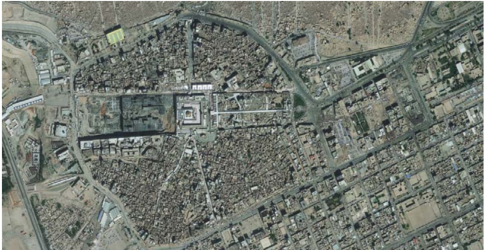
FIGURE 2. Aerial view of Al-Najaf Old City (Nasar, 2015)

it is imperative to preserve the heritage assets of the city and the integrity and vitality of the sacred centre (Directorate of Urban Planning of Najaf Governorate, 2006).