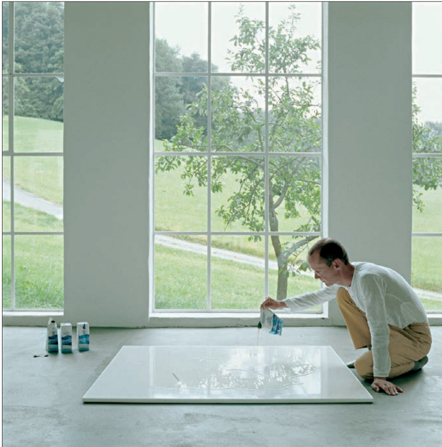
FIGURE 1 LAIB INSTALLING A MILKSTONE PHOTOGRAPHED AT HIS STUDIO IN GERMANY.

Similar in structure to Alessandro Baricco's Silk (1996), Mr Origami is divided in very short chapters that follow a repetitive pattern –occasionally, almost exact same sentences or even pages are duplicated– conforming an at times vegetative narrative tempo. In Ceci's novel, a watchmaker named Casparo arrives at Kurogiku's home with the intention of creating a clock that contains all time measures. When asked about the motivation of his proposition, Casparo tells Kurogiku: «it appeases me. I do as you do: I employ my time in an activity whose utility no one sees» 16 .