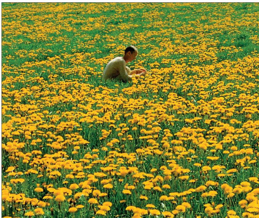
FIGURE 2. LAIB COLLECTING POLLEN IN A MEADOW IN SOUTHERN GERMANY. «FOR ME, THE SKY IS MUCH MORE IMPORTANT THAN TRYING TO MAKE A PAINTING THAT IS A SYMBOL FOR THE SKY. FOR ME, IT'S THE POLLEN ITSELF—THAT IS THE MIRACLE IN WHICH I PARTICIPATE IN MY DAILY LIFE WHEN I COLLECT THE POLLEN. IT'S NOT MINE»*.

Once again, Laib is not interested in accelerated, easily digested proposals. His praxis is connected to nature, its seasons and circadian rhythms: a methodology that collapses with our fast-paced, digitalized, full-of-events routines. He spends so much of his time just to obtain a little of the treasured yellow dust. In this process, nonetheless, he finds transforming potential and value.