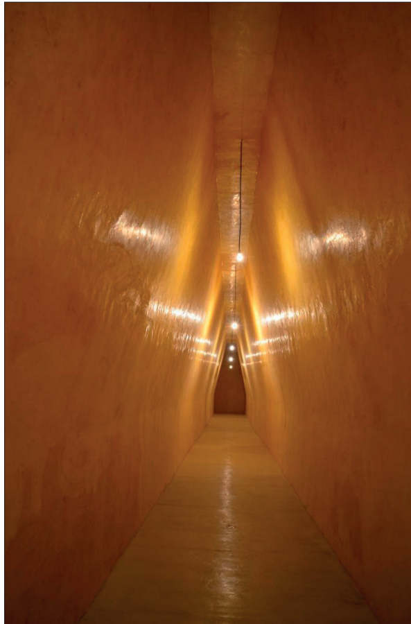
FIGURE 11. WOLFGANG LAIB, FROM THE KNOWN TO THE UNKNOWN - TO WHERE IS YOUR ORACLE LEADING YOU?, 2011-2014. Studio Anselm Kiefer, La Ribaute, Barjac, France.

not me, it's much, much more than myself. And I think that is the secret why this is so powerful 39 .