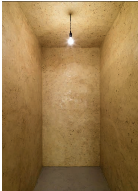
FIGURE 10. WOLFGANG LAIB, WOHIN BIST DU GEGANGEN – WOHIN GEHST DU? (WHERE HAVE YOU GONE – WHERE ARE YOU GOING?), 2013. PERMANENT INSTALLATION AT THE PHILLIPS COLLECTION.

One way in which to perceive changes in the daylight is to be in a landscape, where you are called upon to negotiate your relationship to the changing light conditions. After having been away from artificial light for some time, you will begin to adjust yourself according to the natural light and darkness; a full view of the sky makes a difference to your perception of a rainbow, a blue sky or the varying positions of the clouds. Because these phenomena constantly change, it is possible to register more acutely the relativity of light and the changes of atmosphere that it brings about 36 .