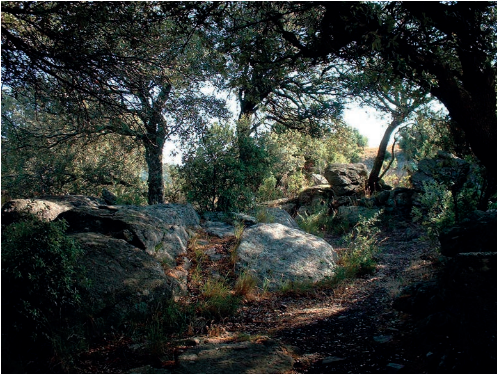
FIGURE 7. VIEW OF THE DISCREET PATH LEADING TO THE CHAMBER.

Michel de Certeau described the mystic as someone «who cannot stop walking» 28 . This idea of wandering, sauntering is essential for Laib, as he himself spends many hours marching around meadows while collecting pollen. In this context, the necessary promenade to La Chambre des Certitudes comes close to the notion of pilgrimage.