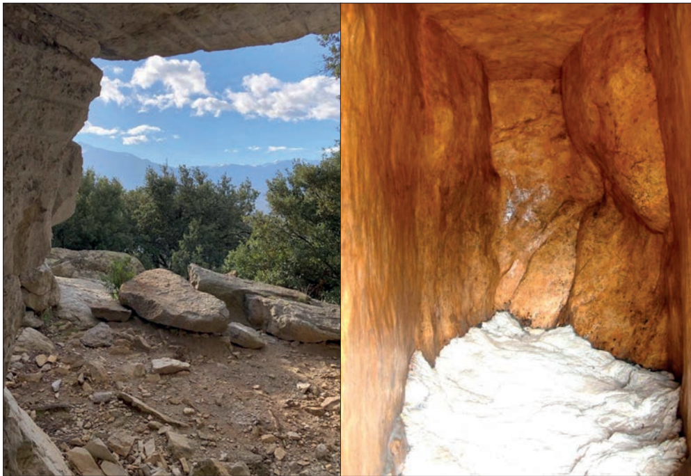
FIGURE 5 AND FIGURE 6. ENTRANCE TO WOLFGANG LAIB'S LA CHAMBRE DES CERTITUDES (LEFT) AND ITS INTERIOR (RIGHT), Roc del Maure, Macervol, France, 2000. ©AEWL

In Roc del Maure, the last high peak before the Pyrenees descends into the Mediterranean, Wolfgang Laib has created a timeless space that apparently grows naturally from the earth. Realised in the year 2000 and only accessible by walk, La Chambre des Certitudes (The Room of Certitudes), is a rock cave chiseled out of granite. Protected by a simple wooden door, its walls and ceiling have been covered with beeswax, creating a sublime, yellowish space. The hot wax was directly applied to the stone with the help of an iron. Beeswax's color varies from yellow to an almost blackish brown depending on factors such as the age and diet of the bees. With a honeylike odor and soft texture, it is obtained by melting the honeycomb and carefully removing impurities. The resulting product is a purified, aromatic, golden liquid that Laib also employs to build small symbolic sculptures.