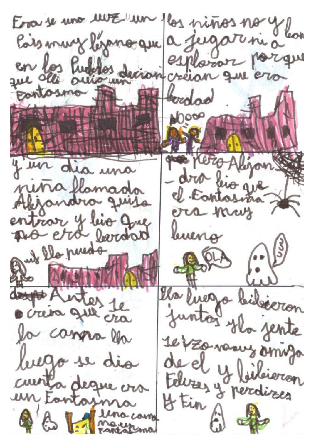
Figure 2. Marina's tale.

Marina presented her tale as an illustrated narration divided in six vignettes (see Figure 2 and Table 6). She added some characters and imagined a full multimodal text including different ambiences (the interior and the exterior of the castle). She added some other elements of her own, such as a title and her signature in the back side of the paper.