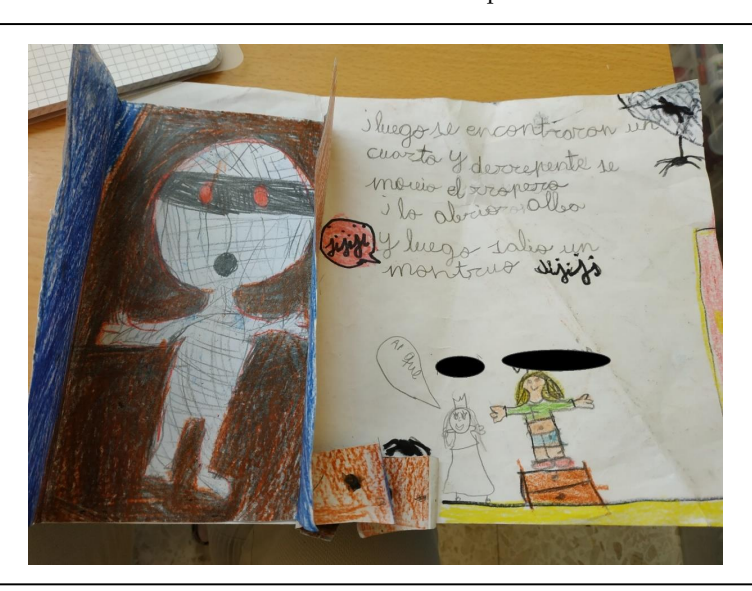
Table 5. Sara's tale transcription.

Sara's story (see Table 5) is a single multimodal text, where the discourse relies on verbal and visual elements interacting between them. The analysis of this text addresses the metafunctions' meaning-making and, particularly, the way in which transitivity, mood and theme are found in the text.