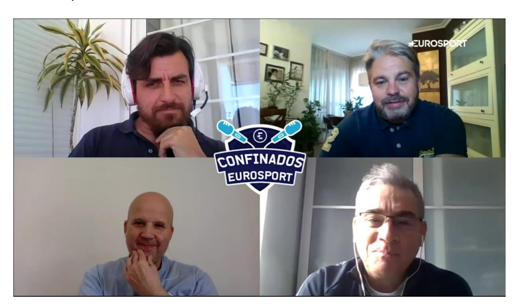
Figure 1 Screenshot from episode 5 of 'Confinados'.