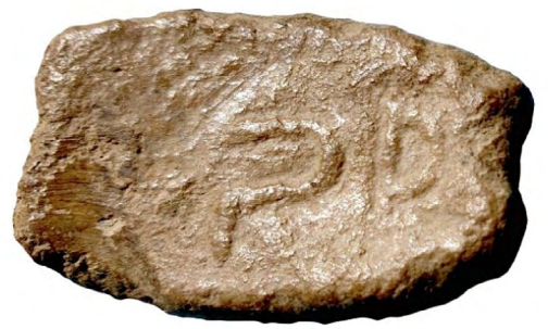
Fig. 1. Bilingual seal of a retrograde muṣālaḥa with SP attributed to Seville.

specifically the SP types attributed to the city of Seville. The contended Visigoth copper has been rather polemically discussed since they were first made known in mid-1990s by Miquel Crusafont. The initial reticence to accept this new material by a part of Spanish numismatic researchers seems to have been slowly overcome by the numerically growing material evidence. However, this continues to raise various questions, in terms of chronology and