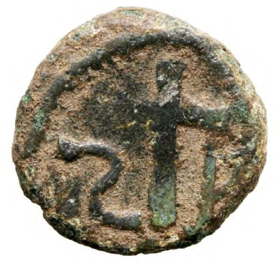
Fig. 4. Bilingual seal with SP and stem in between and Visigothic coin with SP and cross.

stem on steps also was used in the bronze coinage<sup>22</sup> and is present in the transitional fractional gold coins struck during Mūsā b. Nuṣayr's stay in the Iberian Peninsula<sup>23</sup> (Fig. 5).