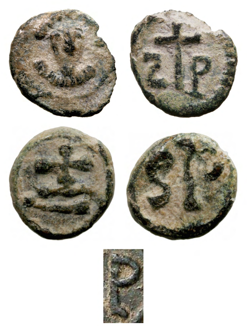
Fig. 2. The Visigothic series with SP attributed to Seville; PL linked.

troduced as an innovation in the tremissis of this monarch, and in terms of the allusion to the mint, since it was also under Leovigild's rule that the name of the issuing city began to be introduced on the gold coins.