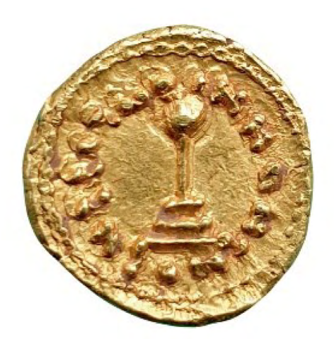
Fig. 5. Reverse of a fractional coin of Mūsā b. Nuṣayr.

stem on steps also was used in the bronze coinage<sup>22</sup> and is present in the transitional fractional gold coins struck during Mūsā b. Nuṣayr's stay in the Iberian Peninsula<sup>23</sup> (Fig. 5).