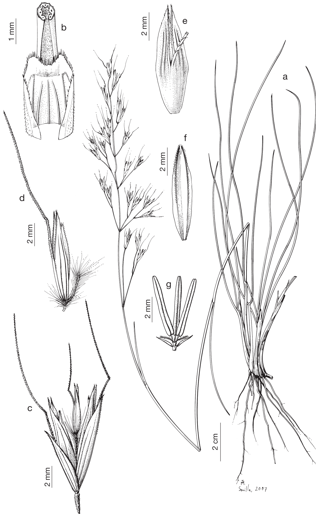
Fig. 3. Helictotrichon devesae (España, Toledo, La Puebla de Almoradiel, SEV 217062): a , habit; b , ligule of basal leaf; c , spikelet; d , dispersal unit in lateral view; e , lemma; f , palea; g , lodicules and fertile parts of floret.