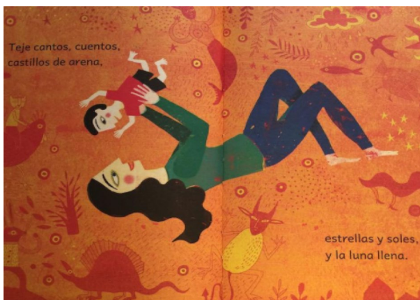
Fig. 3 The mother peacefully plays with her son, surrounded by sea elements (Ruiz Johnson, 2013, pp. 16–17). Courtesy of the publisher. © 2013, Editorial Kalandra. Mamá . Text and illustrations by Mariana Ruiz Johnson

On the contrary, in A veces mamá tiene truenos en la cabeza (Taboada & Padrón, 2020), there is a crescendo in the expression of negativity, which is balanced by the positive affections. The main character is saddened, angered and bored by society's demands or lack of aims (see Fig. 5). Nevertheless, the