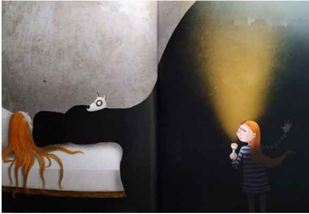
Fig. 4 The daughter, holding a torch, observes her mother lying in bed dressed in black (Carretero, 2016, pp. 14–15). Courtesy of the publisher. © 2016, Cuentos de luz. Los vestidos de mamá . Text and illustrations by Mónica Carretero

expression ‘a veces’ (sometimes) in the title states that the mother is not always bad-tempered.