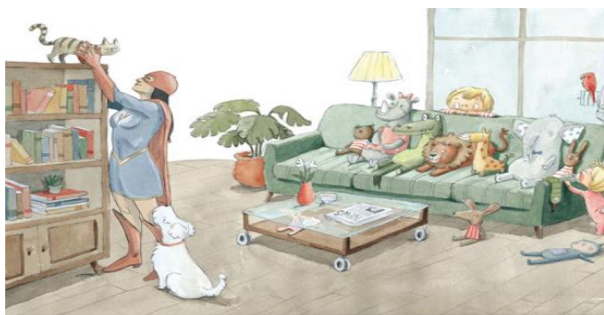
Fig. 1 The supermother saving all the pets of the house (Bonilla & Mallet, 2018, pp. 31–32). Max y los superhéroes . Text and illustrations Rocío Bonilla & Oriol Mallet

The picturebook Mamá (Ruiz Johnson, 2013) shows a completely contrary perspective. The main character is defined by her own son as 'a universe that everything hides' (Ruiz Johnson, 2013, pp. 22–23), inaugurating a close-to-nature form of mothering (Martucci, 2015; Mellor, 2018). The mother in this work feels fears and sadness, even though negative emotions connected with ecosocial wellbeing or the pursuit of aims (see Table 3) were systematically sweetened. This picturebook is associated with a kind of feminism that reclaims female qualities such as sensibility, intuition, less aggression, and the capacity to protect and