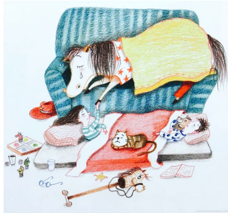
Fig. 2 The mother, transformed into a horse, crying while holding her daughter's hand (Tello, 2017, p. 31). Mamá al galope . Text and illustrations by Jimena Tello

care (Stephens, 2012), assuming that these are the universal characteristics of all women (see Fig. 3).