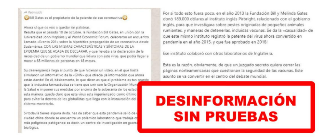
Figure 8: WhatsApp message stating that Bill Gates is the owner of the COVID-19 patent