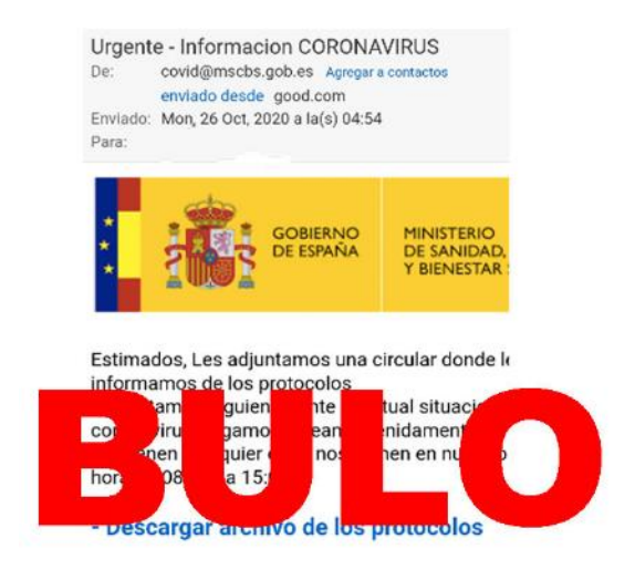
Figure 9: Malware Distributor Mail

Hoaxes that pursue fraud or the transmission of a computer virus constitute 2% of the total. Throughout this research, 2 fake news items spread by email have been detected, the aim of which was to infect electronic devices. These malware attacks supposedly came from the Ministry of Health and announced the perimeter restrictions imposed by the Government and the protocols to follow to fight COVID-19 (See Figure 9).