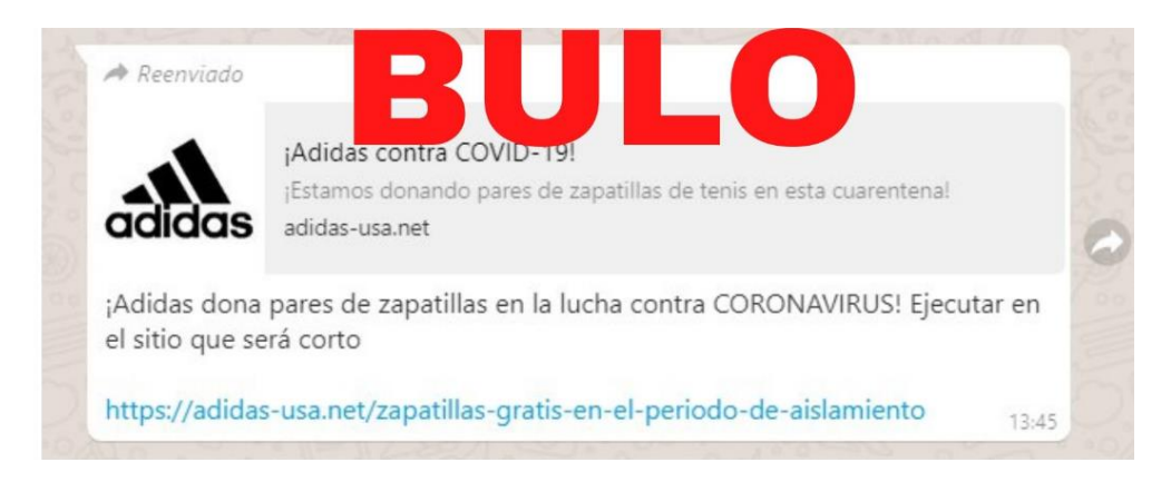
Figure 10: WhatsApp message announcing the donation of sneakers by Adidas

euros from Social Security, and even the donation of sneakers by Nike and Adidas, among others.