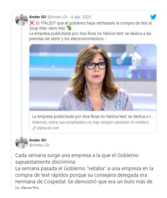
Figure 2: Fake News about the rejection of the test purchase

The Socialist Party also denounced in the Andalusian Parliament (See Figure 3) the alleged shortage of personal protective equipment (PPE) in the Puerta del Mar hospital in Cádiz, information that had been viralized through WhatsApp with invented data and that the National Police itself, in a statement sent to the media, had to deny and remind citizens "not to contribute to viralizing alarmist hoaxes."