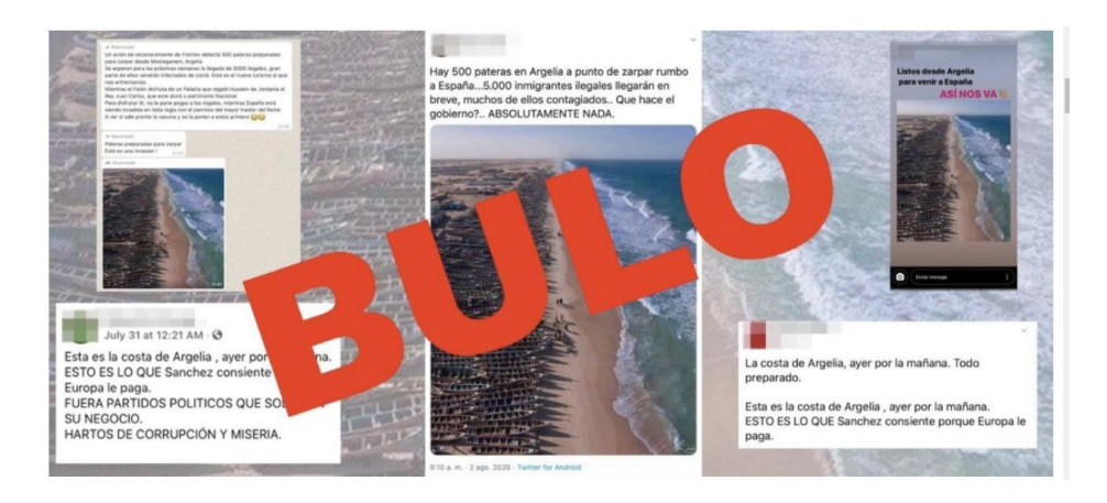
Figure 5: Hoax about boats about to leave for Spain

The list of hoaxes that blame immigrants for the problems and that expand xenophobia, racism, and aporophobia is long and varied, from supposed regulatory procedures announced by the Government, the perception of the Minimum Vital income for those arriving in boats and their denial to the Spanish unemployed, up to 500 boats in Algeria about to set sail for Spain with infected people and which, in reality, were fishing boats (See Figure 5).