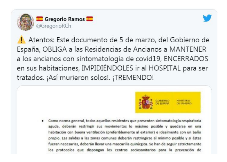
Figure 4: Hoax on the genocide of the elderly decreed by the Government

The hoaxes created by this type of platform about COVID-19 have jeopardized cybersecurity based on disinformation campaigns or hoaxes that could generate "disaffection of government institutions." The most notorious case is that of a chain of messages that accuses the Government of the genocide of the elderly, stating that residences are forced to lock up elderly people infected with coronavirus in their rooms and prevent them from going to the hospital to be treated (See Figure 4).