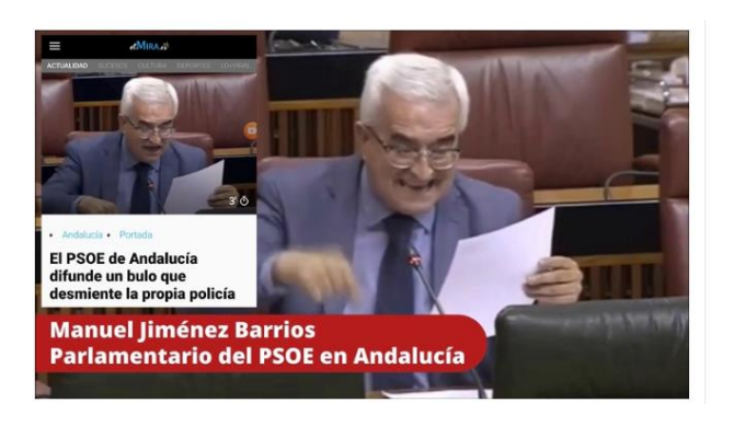
Figure 3: Jiménez Barrios (PSOE) spreading a hoax in Parliament

The Socialist Party also denounced in the Andalusian Parliament (See Figure 3) the alleged shortage of personal protective equipment (PPE) in the Puerta del Mar hospital in Cádiz, information that had been viralized through WhatsApp with invented data and that the National Police itself, in a statement sent to the media, had to deny and remind citizens "not to contribute to viralizing alarmist hoaxes."