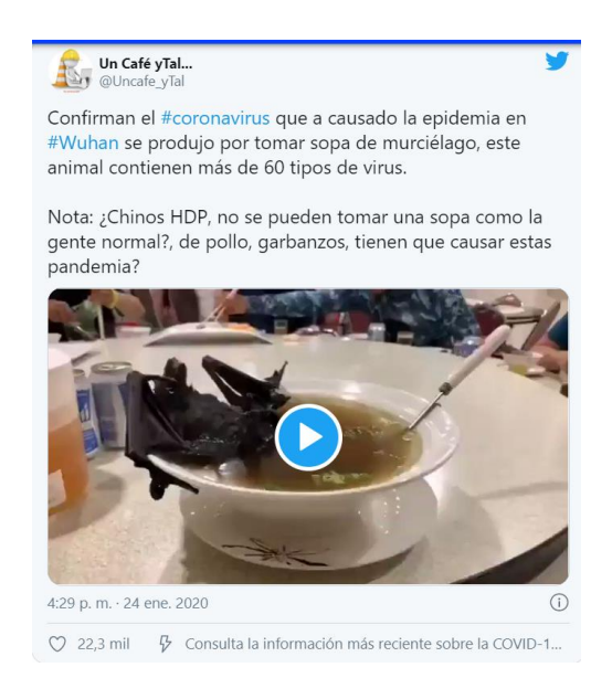
Figure 7: Fake Twitter video about bat soup in Wuhan

Among the many hoaxes that circulate about the origin of the pandemic, we find those that affirm that the coronavirus was produced by eating bat soup (See Figure 7) or that the snakes that eat these bats become carriers of the virus. Others directly point to the fact that the purchase of products from affected countries can infect, hoaxes that cause the destabilization of the economy and harm certain countries.