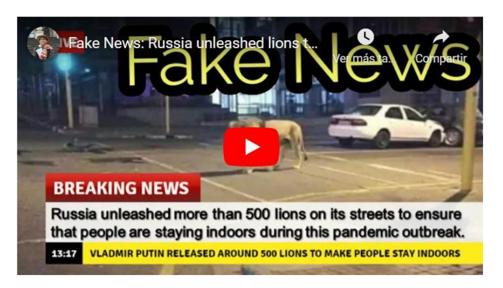
Figure 1: Fake News about the release of lions in Russia

section of the Telemadrid newsletter (Mayor, 2020). Others even suggest that the Russian president gave the order to release 500 lions to force the population to respect the confinement (See Figure 1).