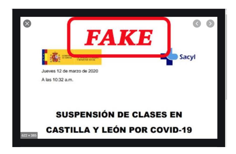
Figure 6: False statement of suspension of classes in Castilla y León

Although this type of news often offers contradictory and illogical data, at a time when uncertainty marks the day to day, the need for updated information leads citizens to give fuel to news that generates confusion. Thus, for example, we find the false letters that announced the suspension of classes in Castilla y León (See Figure 6) and Andalusia, the delay in the Selectivity tests in August, or the use of Zoom connections to distribute malware and capture personal data.