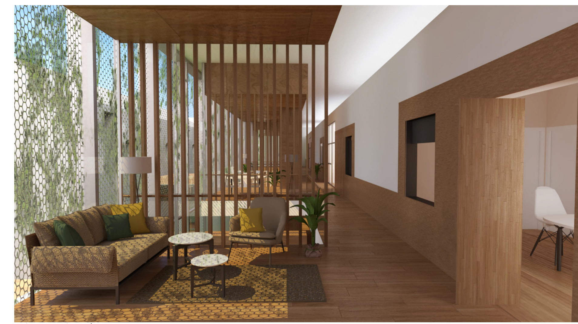
VISTA INTERIOR DÍA