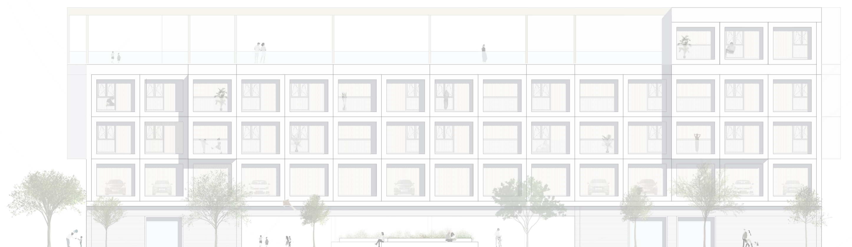
1:175 0 2 4 8 Alzado sur