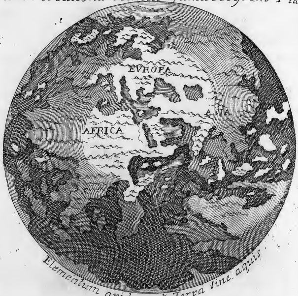
Elementum apidum, et Terra sine aquis.