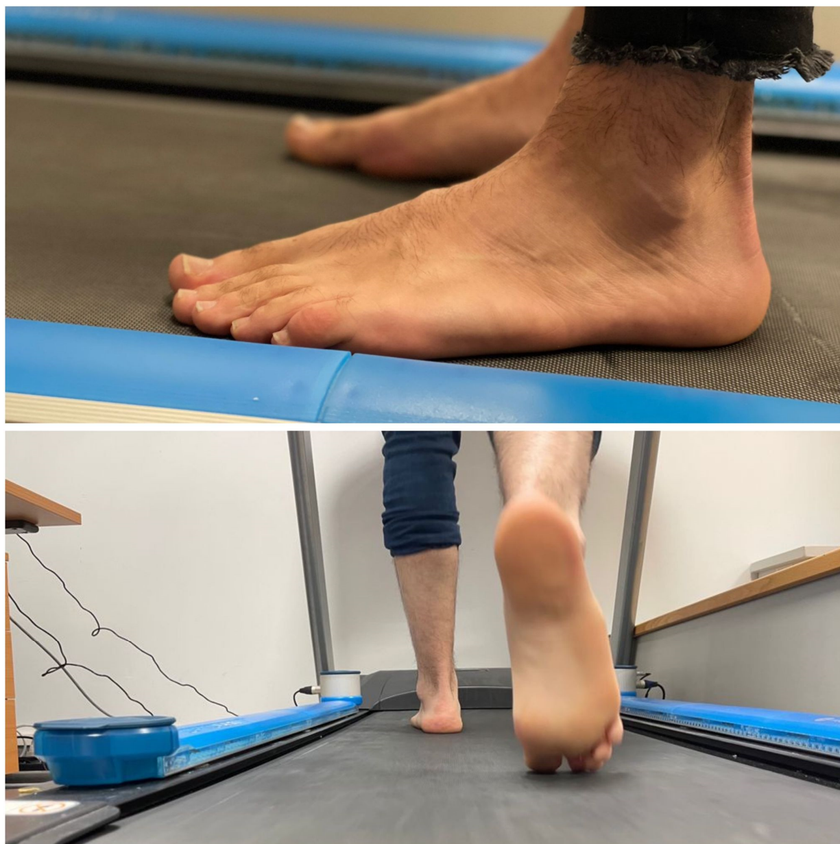
Figure 2. OptoGait treadmill gait analysis.

A couple of one-meter photocell systems were placed next to the treadmill at a speed of 4 km per hour, and previously, the size of the subject's bare foot was recorded. The results obtained through this system are commonly used to correct asymmetry in gait parameters by using custom plantar supports.