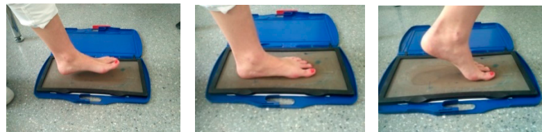
Figure 2. The patient walks on the ink footprint device to take the foot print. The progression of the step is shown during the standing phase. The other limb progresses from back to forward.

Foot Posture Index is a clinical tool to assess foot posture during weight bearing by collecting data from six criteria (palpation of the head of the talus; curvature difference above and below the peroneal malleolus; position of the calcaneus in the frontal plane; prominence in the talo-navicular joint; the medial longitudinal arch's congruence; and abduction/adduction of the forefoot from the posterior view), which are scored from +2 to −2. Values between −12 and +12 may be obtained in order to classify feet in neutral (0 to +5), supinated (−4 to −1), highly supinated (−12 to −5), pronated (+6 to +9) or highly pronated positions [20]. Ink footprints were obtained from all participants (Figure 2).