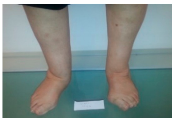
Figure 1. Rheumatoid arthritis feet deformities inspected in the standing position: Hallux abductus valgus, flatfeet and fibular deviation of metatarsophalangeal joints are observed. Foot posture index evaluation in the anterior view.

The forefoot is commonly involved, especially metatarsophalangeal joints [2] and hypermobility of the first ray [8]. Hallux abductus valgus, lesser toes deformities, metatarsophalangeal joints subluxations, or distal displacement of the plantar pad, are typical disorders [3,4,9,10]. One of the most prevalent pathologies in patients with RA is a rearfoot valgus misalignment, which may be associated with other foot problems (such as those previously mentioned) and symptoms [11]. In addition, flatness of the longitudinal arch is frequently observed, as well as extra-articular manifestations, such as bursitis, nodules, hyperkeratosis and ulcers [7] (Figure 1).