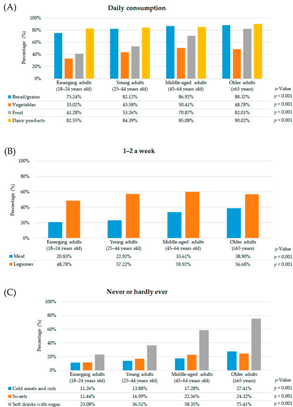
Figure 1. Frequency of food consumption according to age groups of participants with common mental disorders ( n = 12,545 ) (SNHS 2006, SNHS 2011/2012 and SNHS 2017) ((A) for daily consumption, (B) for 1–2 a week, (C) for never or hardly ever).