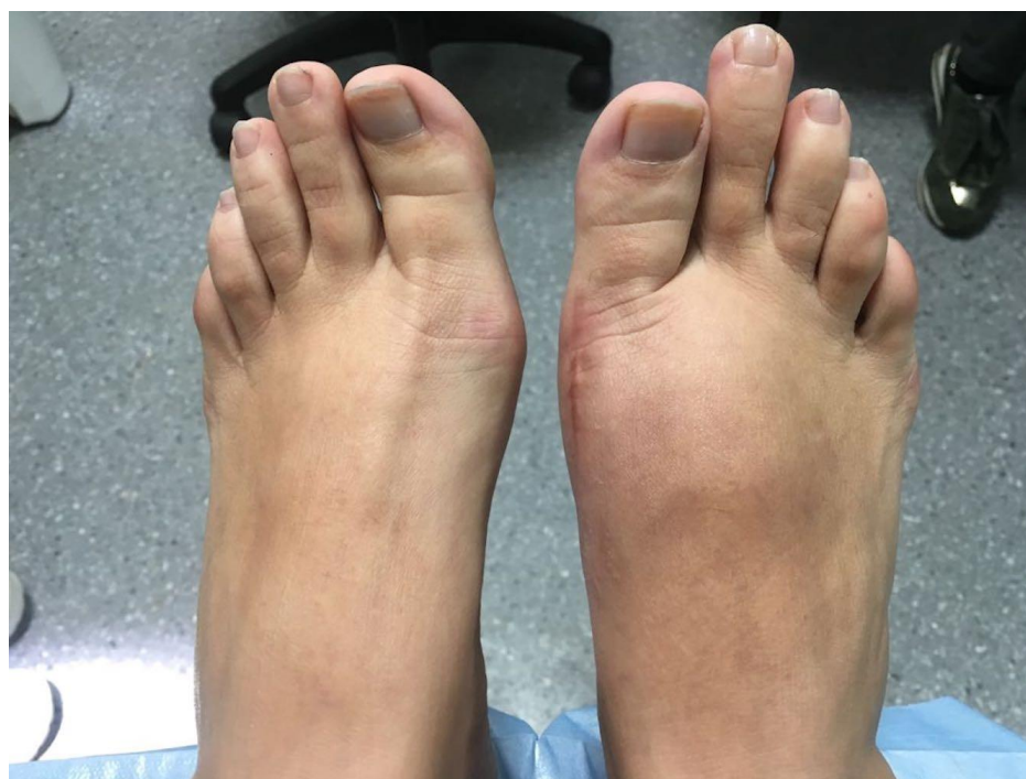
Figure 1. Image of appearance of both feet on arrival at clinic, highlighting shortening of first radius of the right foot with respect to the left foot.

Clinical examination revealed a cavus valgus foot with persistent edema and erythema evolved over 2 years. The shortening of the first radius in the operated foot with respect to the contralateral foot was significant, as was a hypertrophic and sensitive scar (Figure 1).