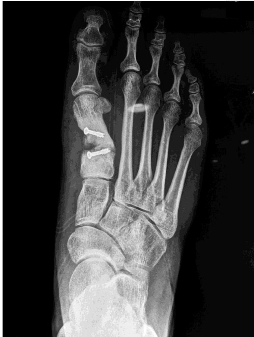
Figure 2. Rx AP immediately preoperative.