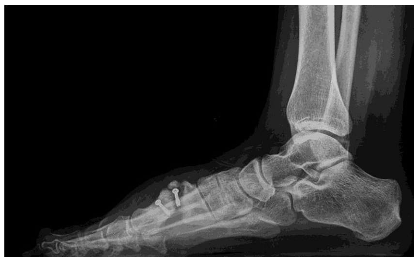
Figure 3. Rx Lateral immediately preoperative.