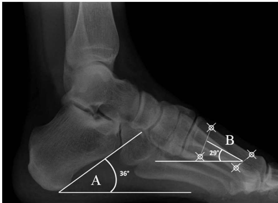
Figure 2. Radiological assessment of the calcaneal pitch angle (A), and the first metatarsal declination angle (B).

Statistical analysis was performed using the PASW Advanced Statistics (version 23.0; SPSS, Inc, Chicago, IL). Data are reported as mean and standard deviation. Normal distribution of study variables was assessed using the Shapiro–Wilk test. To check the intra-rater reliability of the assessment procedure, 10 radiographs were randomly chosen, and the internal MCBA, the CPA, and the FMDA were measured twice, with 10 days between measurements. The intra-class correlation coefficient was calculated using the data obtained from these measurements. [41] A repeated-measures analysis of variance (ANOVA) was applied to assess changes in the radiological angles from baseline to immediately postintervention and 1 week after intervention. Bonferroni adjustment for post hoc pairwise comparisons was used. Mixed-model ANOVAs were used to compare the differences