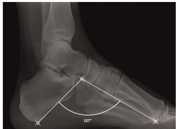
Figure 1. Radiological assessment of the internal Moreau–Costa–Bertani angle.

A lateral weight-bearing foot radiograph was acquired using a portable X-ray device operating at 45 kV and 4 mA/s (Sedecal SPS HF-4.0; Sedecal, Madrid, Spain). Radiographs were taken from