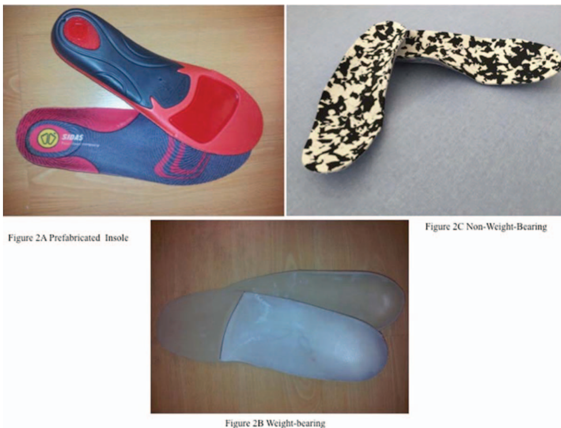
Figure 2A Prefabricated Insole