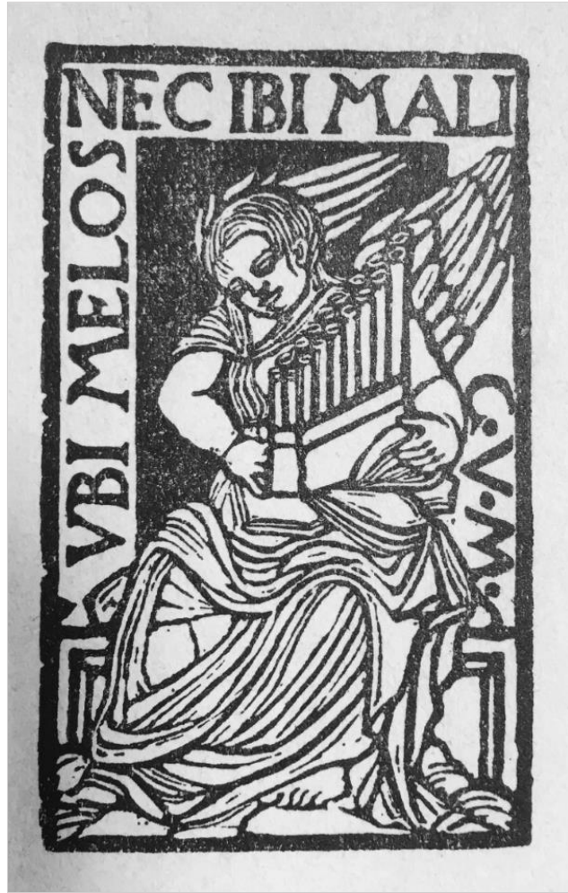
Fig. 3. - Fig. 4. Angels with harp and portable organ , Agostino di Duccio, mid-fifteenth century, chapel of San Michele Arcangelo at Malatesta Temple in Rimini.