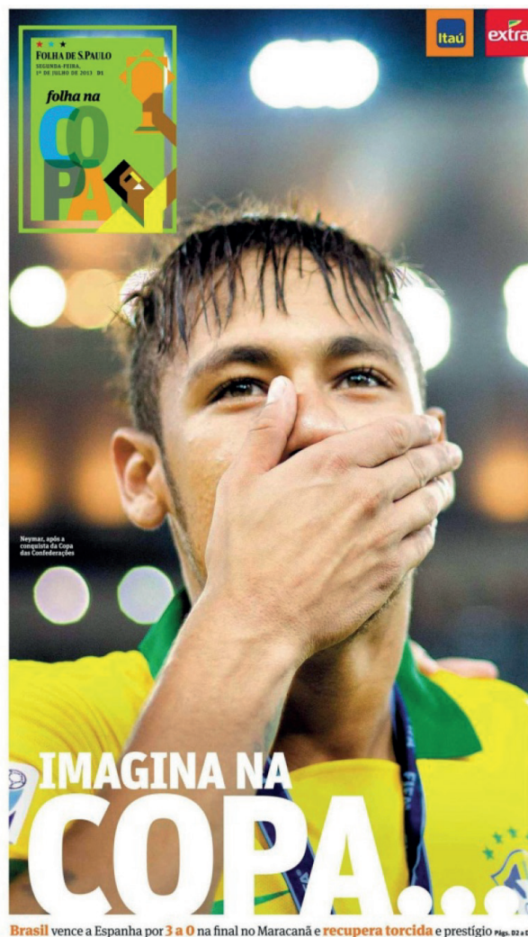
Source: Folha de S. Paulo , São Paulo, v. 93, no. 30770, p. D1, July 1, 2013. Sports Section.

The subject of the news was the same. They spoke of pride and joked with the sentence used to complain about Brazil’s urban problems: “Imagine it during the World Cup”. Thus, the “awakening of the giant” – a motto of the June demonstrations – was assimilated to the logic of the sporting event: it was a reminder that “The country can work” and “The Champion is back”. In fact, Brazilian national pride took over the newspaper and was in every page – everything was incredibly perfect again, except for three stories about infrastructure issues as an analysis of what the test-event was like. However, it was still below the other 24 articles extolling the Brazilian team of David Luiz, Fred, Júlio César, Neymar and the father of the nation, Coach Scolari.