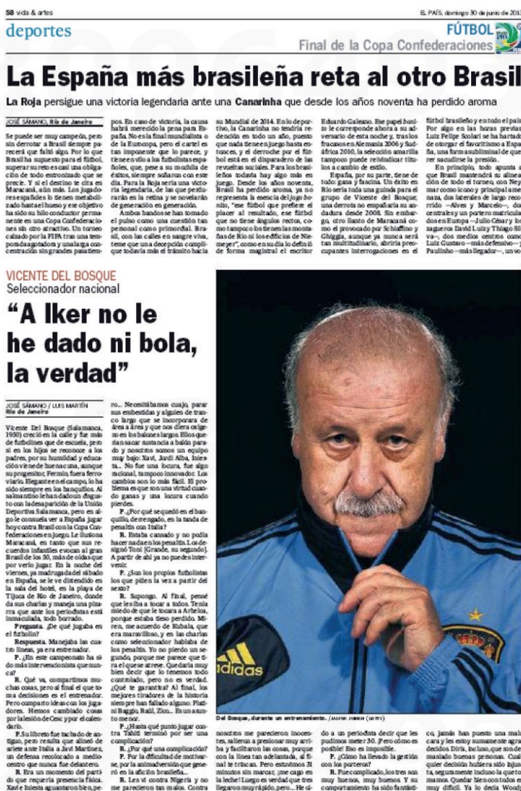
Figure 5 - Journal of Sports Notebook El País on June 30, 2013