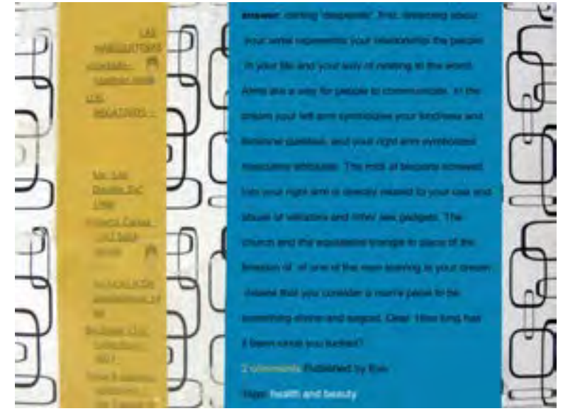
Figure 4. Doctor Xin's first interpretation of the false dream, by Doctor Xin. Fragment of the mixed installation Anonymous Sender (2008).