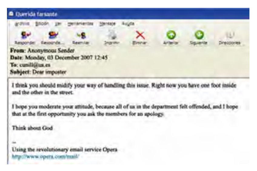
Figure 1. Anonymous message (3 December 2007). Printscreen.

How can the artistic experience (exemplified by Doctor Xin) be connected with the anonymous message? Are there artistic means of healing and