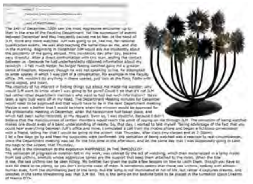
Figure 10. Lamp of Watchfulness (2007) Object sculpture (sea urchins, iron and plastics, diameter of 40 cms.) and the email that accompanied it (printscreen).

Through a number of works created during the worst part of the harassment, I can now see a connection between the development of my artistic codes and the expression of distress already identified by psychologists in the process of harassment. This is explored in Figure 10.