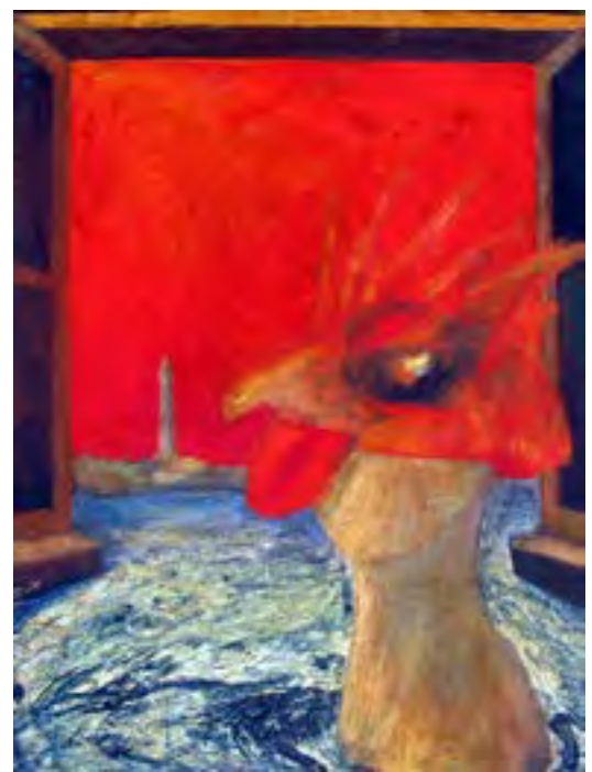
Figure 8. Self-portrait as a Flying Chicken (2005). Acrylic painting. 73 \times 60 \text{ cms} .