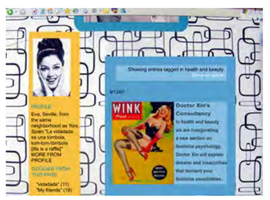
Figure 3. Introduction page for Doctor Xin's Consultancy. Fragment of the mixed installation Anonymous Sender (2008).

Is there any correlation between the development of the visual idea and the stages described by psychologists regarding workplace harassment?