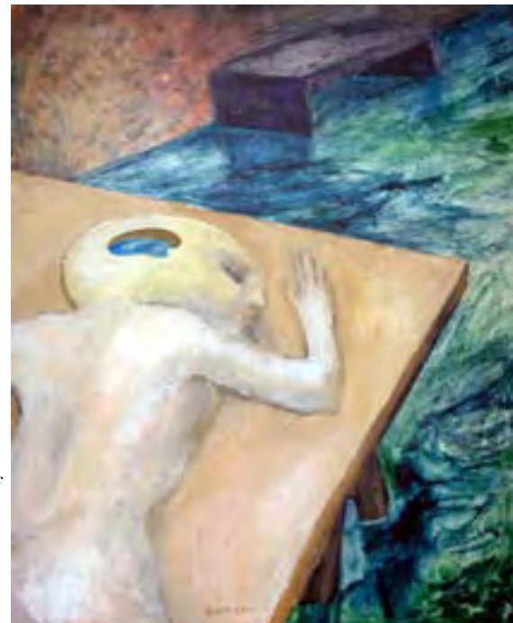
Figure 7. The Soul Delivers Itself to the Water (2005). Acrylic painting. 78 x 65 cms.