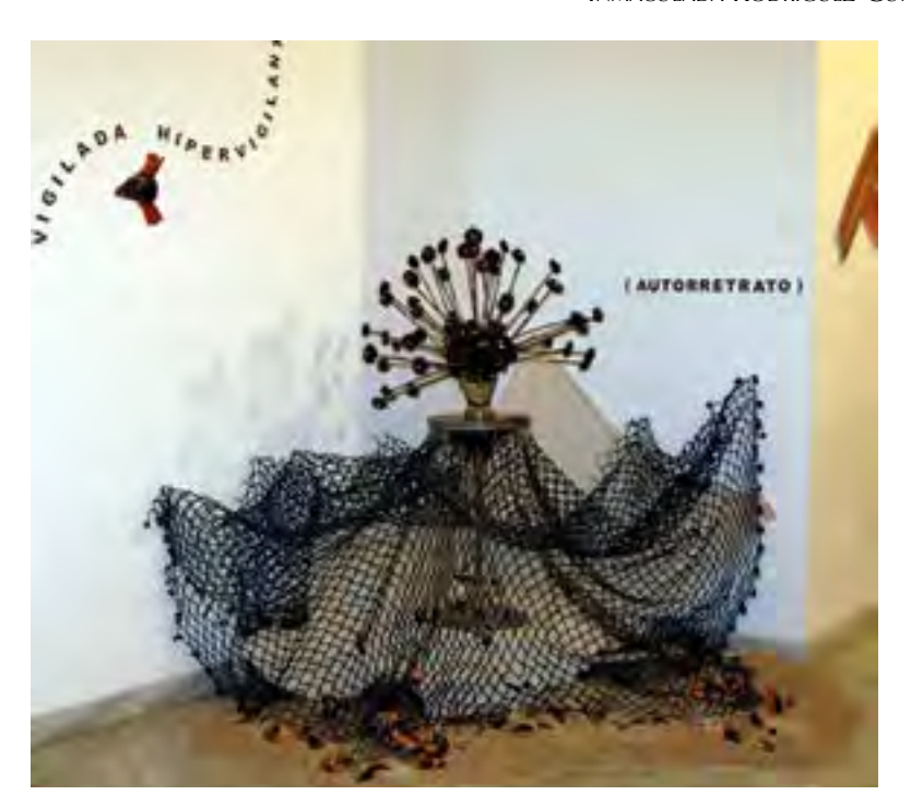
Figure 12. The Hyper-watchful Watched Women. Varying dimensions. Head: diameter of 120 cms. Total height 180 cms. Glass, polyester, doll eyes and legs, sea urchins, hair, mussels, fishing nets, sand. This piece was also part of the event in the Cultural Center of Villa de San José de la Rinconada, as Our Lady of Metamorphosis and All Changes.

The self-portrait installation The Hyper-watchful Watched Women has a centralized structure. The head is made of glass; it is transparent (the gaze of others can pierce her mind), and she watches everything happening around her because she feels watched, just as the individuals locked in the cells of the panopticon know that they can always be watched, even if they are not actually being watched all the time. The permanence of the state of being watched creates in the prisoner (and in the target of harassment) a psychological effect, which ultimately causes the prisoner to carry out self-surveillance. It was this horrible sensation, this state of