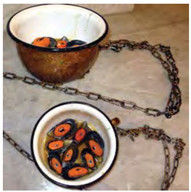
Figure 11. The Watch Guard of Anal and Vaginal Orifices (2007). Composition with the object sculture. Spittoon and polyester. Diameter of 21 cms. 32 cms high.

Dreams of Marina D'Or was an installation piece shown in 2008, nine months after the creation of the Lamp of Watchfulness, which was placed on a bedside table as a watch guard for nightmares in the bedroom. This installation also included another work dedicated to surveillance, The Watch Guard of Anal and Vaginal Orifices (Figure 11). Conceived as a bedroom object close to our dreams, it is placed among nocturnal experiences. The sensation of being watched was a constant element in my dreams. Even in the most private moments, in the middle of the night, I would go to the bathroom, and I would still feel intimidated by surveillance even in the most private places.