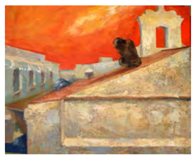
Figure 6. The Dark Man (2005). Acrylic painting. 73 x 60 cms.

Matud, Velasco, Sánchez, del Pino, and Voltes (2013) explain that while workplace harassment negatively affects the mental health of everyone who suffers it, the effect is much greater in women than in men.