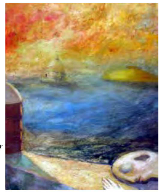
Figure 9. Soul, Dome and Tower (2005). Acrylic painting. 78 x 65 cms.

conflict before it can be concealed.8 7. However, rumors about my sexual orientation started. 8. Beginning with Leymann (1996) and allowing for some variations, mobbing is described in terms of four stages: conflict; stigmatization or mobbing (about six months); organizational intervention (being negative or positive); and expulsion or marginalization. If the process of mobbing is prolonged, this tends to increase the sense of culpability and leads to deterioration in the health of the person being harassed. The victim cycles through leaves of absence and reincorporation, increasing the stigmatization from the organization, which will then have more reasons to blame the conflict on the psychological problems of the victim. In this sense, the final resolution of the conflict is in many cases the expulsion of the victim from the position, and sometimes from the job market as a whole. This might happen in any number of ways: completely and definitively isolating the victim; repeatedly changing her position and responsibilities, dismissing her with compensation; granting an indefinite leave of absence; or requesting that the victim be admitted for psychiatric care.