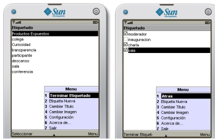
Figure 3: Mobile Application, nonterminal (left) and terminal (right) screens.

platform which provides basic Web 2.0 features for users.