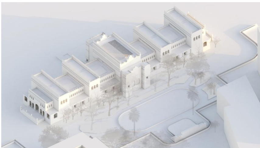
Figure 4. Current volumetric definition of the Seville Archaeological Museum (rendering by the authors)

At the time when the Archaeological Museum of Seville was installed in its definitive building, this meant a reuse of a large building that did not seem to imply major changes. To a large extent, this was due to the little development of the institution in particular, as well as to the little technification and normativization that the museums had by then.