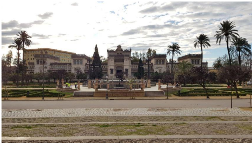
Figure 3. Seville Archaeological Museum at the America Square

On the other hand, with its presence today, the museum recalls this event of national and international impact, perpetuating its image. The use as headquarters of a state museum institution makes this effort to achieve a representativeness of its image and the sense of meeting place of its spaces. The exhibition purpose of the building remains, being in origin temporary and now started by an important permanent collection of archaeology. Similarly, both destinations share that they were and are support for urban cultural tourism. This is an increasingly widespread and socially present reality.