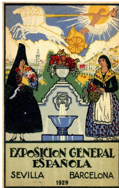
Figure 1. General Spanish Exhibition: poster.

museum experiences served to create the first 19 international exhibitions (1851-1928) [3]. The architecture of the pavilions imported many precepts of museum architecture, although shaded by its vocation to be ephemeral. In general, at the end of these exhibitions, most of the pavilions were dismantled or demolished, with very specific cases in which they were reused. In this sense, the case of Seville is quite relevant because of the large number of buildings that have been preserved and adapted to new uses.