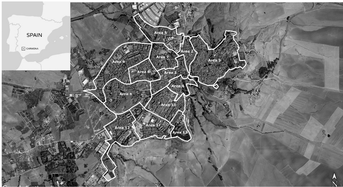
Figure 1. Map of the town of Carmona (Andalusia, Spain) divided into 13 homogeneous areas.

For optimal data collection, door-to-door household surveys were completed during two periods: from February to May and September to November 2018. A representative sample of respondents was obtained by age, gender, and geographic reference data from the Carmona population census updated for 2017 with a 95% confidence level. The inclusion criteria taken into account to evaluate anxiety and depression were respondents older than 18 years of age with at least one year of residence in their current home, established in previous studies [1]; identified as the minimum time required to achieve mental health benefits from a green view. We obtained 479 respondents between 18 and 64 years of age residing in the main family dwelling at the time of the survey (Figure 2).