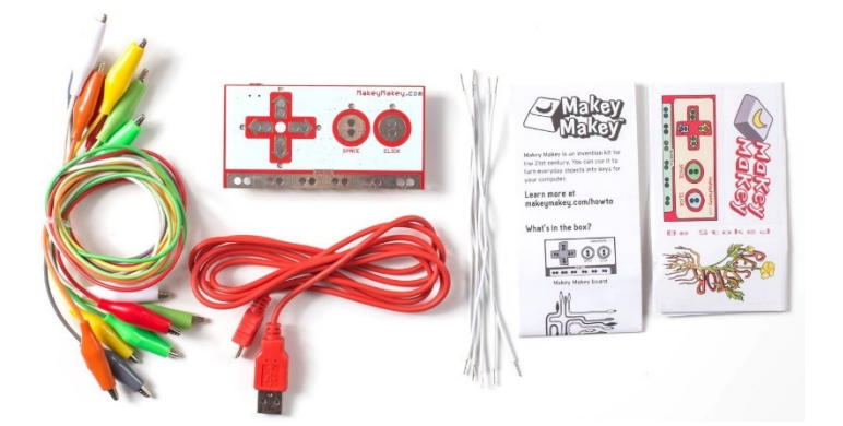
Figure 3. Makey-Makey board by Joylabz (http://bit.ly/placa-makey-makey).

Makey-Makey is a board similar to the command of a game console, the computer (PC or Macintosh) detects it as if it were a keyboard or mouse, which allows sending commands to the computer to which it is connected. Instead of pressing the buttons on the keyboard, what we do is close the circuit using contacts or crocodile clips, and this simulates having pressed a button. In this way, it allows us to convert any object of daily life into a keyboard, remote control, or a mouse.