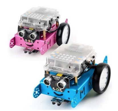
Figure 2. MBot by Makeblock (http://bit.ly/mbot-makeblock).

The second one was mBot (Figure 2), from the Chinese manufacturer Makeblock, specially designed for primary and secondary education.