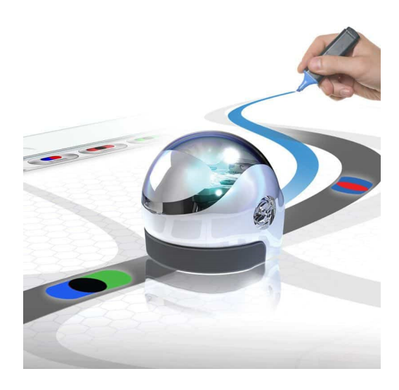
Figure 4. Ozobot (http://bit.ly/placa-makey-makey).

Table 1. Comparative table of the robots used in the study. Competences/abilities they develop.