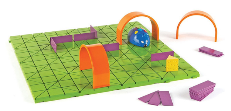
Figure 1. Mouse Robot Colby, by learning resources (http://bit.ly/mouse-robot).

The Mouse Robot promotes problem-solving, critical thinking, basic programming skills, motivation, curiosity, respect for peers and educational materials, participation, collaborative work, self-learning, the shared construction of knowledge, access to new channels of information and knowledge, application knowledge, creativity, imagination, learning to learn, skills in and with ICT, and especially tolerance to stress and frustration. Students choose an activity card (a circuit of the 20 provided by the cards that come with the mouse) and plan their route using the code cards with arrows forward, backward, turn left and right, to guide the mouse to the target. When the movement sequence is already programmed, the student presses the upper green mouse button.