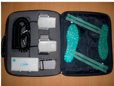
Figure 1. Biofoot in-shoe system.

with 64 piezoelectric sensors (0.5 mm thickness, 5 mm diameter). Data is sent by digital telemetry from the amplifier to be logged on a computer and then processed by software that shows the plantar pressure (kPa), contact time (s), and cadence (steps/minute) parameters. The digital telemetry system has a range of 200 m with sampling rates between 50 and 250 Hz. The system has been shown to be reliable [27].