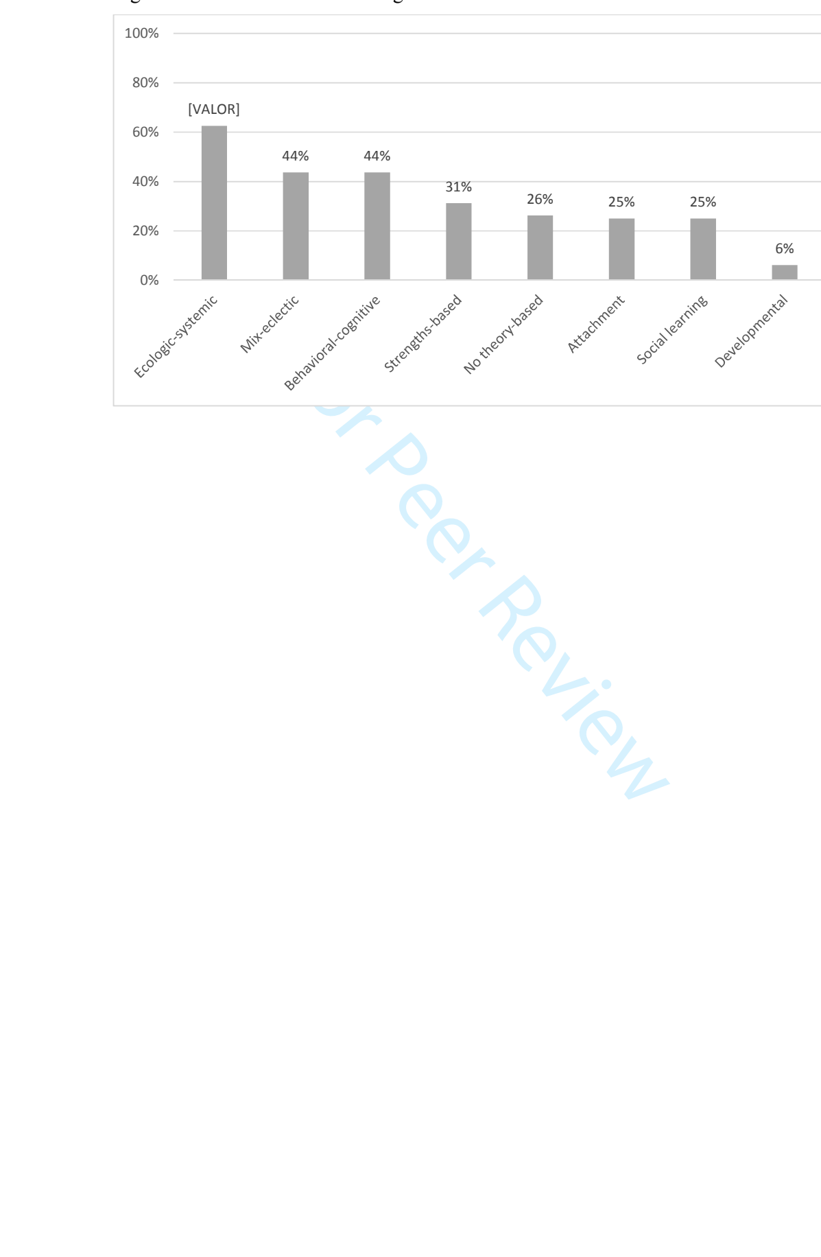
Figure 2. Theoretical models that guided the interventions