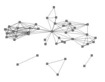
Density = 0.149; Number of cliques= 25.