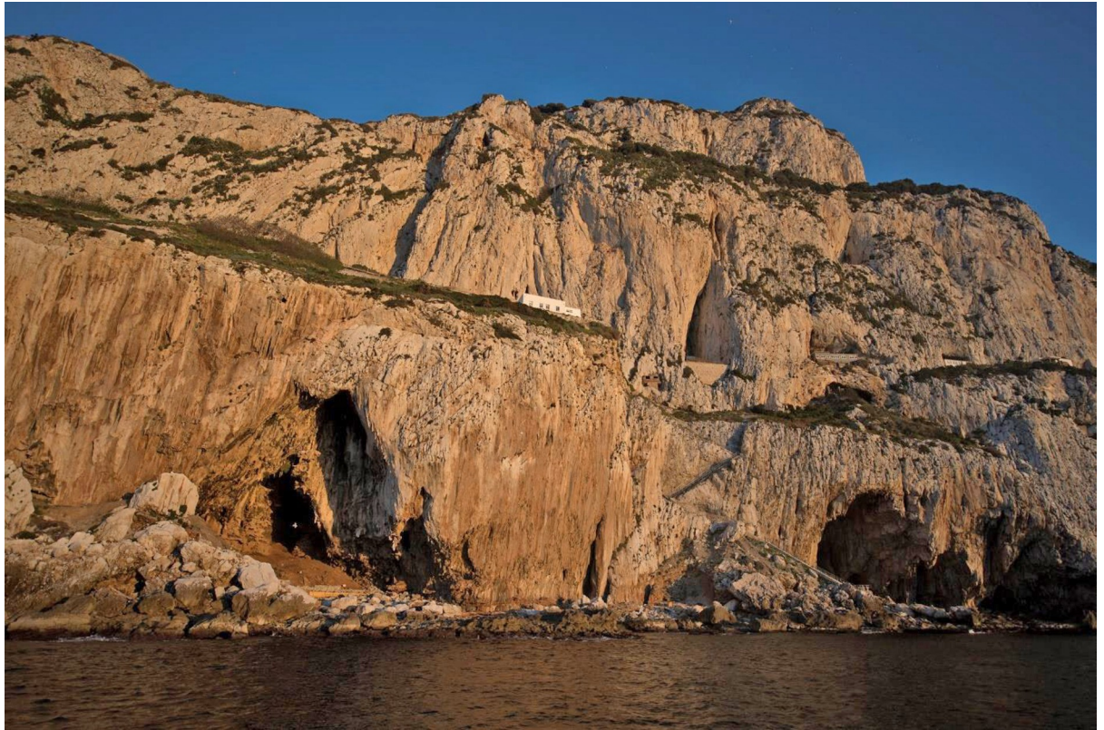
Fig 4. Gorham's Cave at the base of Mons Calpe (Gibraltar) from the sea today.

https://doi.org/10.1371/journal.pone.0249606.g004