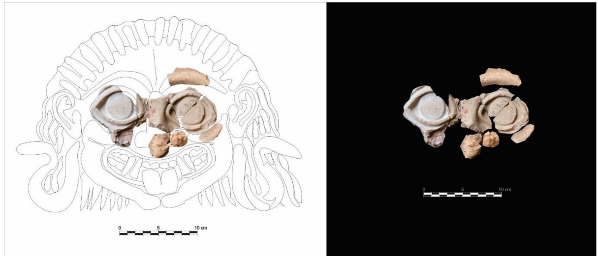
Fig 3. Fragments recovered from Gorham's Cave (right) with a reconstruction of the complete Gorgoneion. See also S1 File . Specimen IDs: GOR/98/B3/52a; GOR/98/B3/52b; GOR/98/B3/52c; GOR/98/B3/52d; GOR/98/B3/52e; GOR/98/B3/52f; GOR/98/B3/52g; GOR/98/B3/52h; GORHAM'S C 1958 GA7(a); GORHAM'S C 1958 GA7(b); GOR99/alpha2/N I/140; GOR99/alpha alpha2/N I/36. Stored at The Gibraltar National Museum, Gibraltar. All necessary permits were obtained for the described study, which complied with all relevant regulations.

https://doi.org/10.1371/journal.pone.0249606.g003